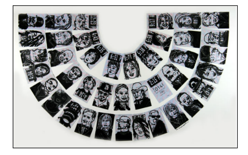
Figure 23 - About Facec - Heat on TTC Subway Transfers – 19 x 27 – By: Shannon (Sh.Sh) - 2007

Whenever I used to travel with the train (subway) I used to sit at the very end of the train and look at people. I usually sketch faces in my little sketchbook. They gradually became my stories, my sources of knowing Canada and my being here started to become more real to me. I used to observe how individuals from different backgrounds and cultures sit next to each other, all united and equal; no one is above the other. I then used the streetcar and transfer tickets instead of paper and canvas for my art. This was because I believe that those tickets had dates and reminded me of the season, or the time of the day, that my encounters or observations with others took place. (See Figures 23-25)