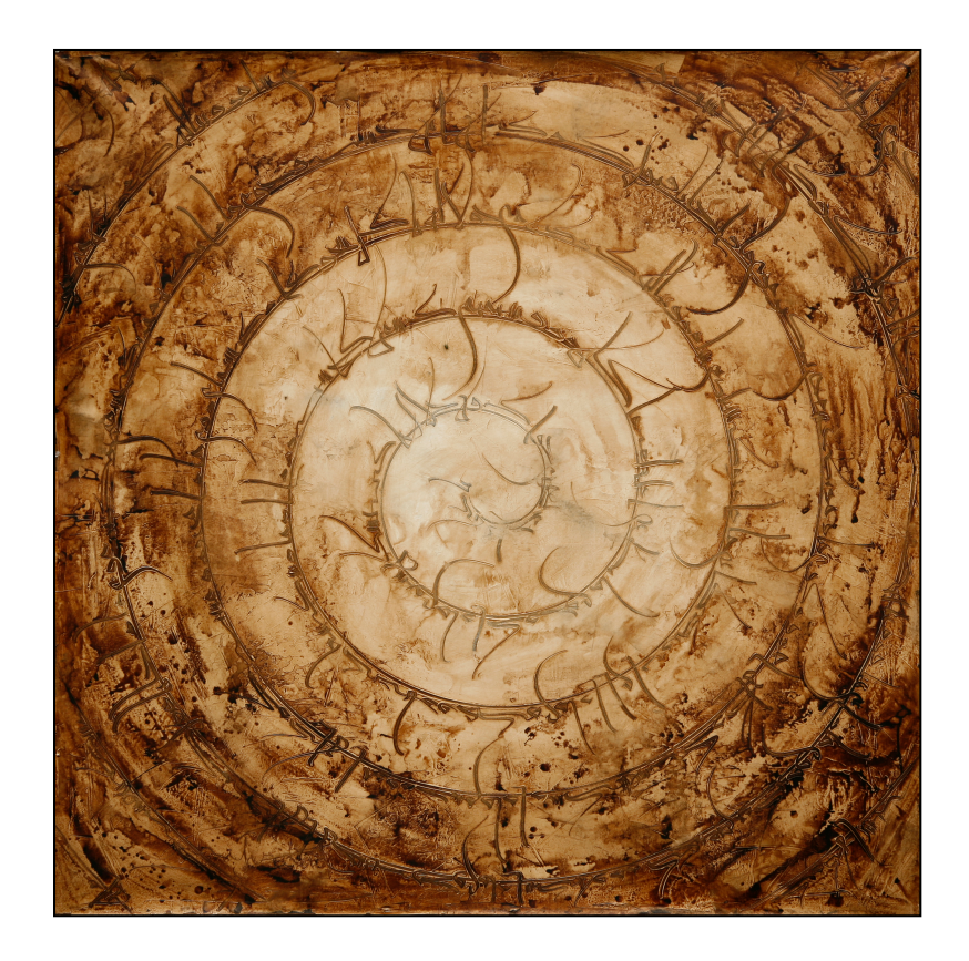
Figure 13 - Untitled – By: Mike (M.Sh) - n.d.