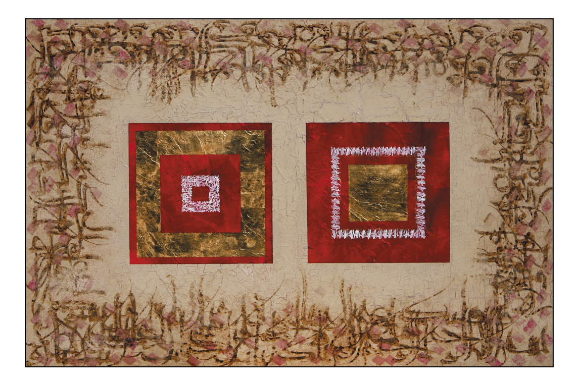
Figure 12 - Untitled - Multimedia on Canvas – By: Mike (M.Sh) - n.d.