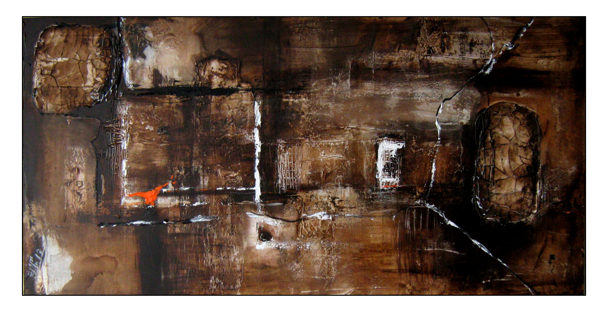
Figure 10 - Hidden - Acrylic on Canvas – By: Sara (F.K) – n.d.

I have so many paintings that if you pay attention you will notice that there are layers over layers. There were some times when I used to finish one piece, then look at it and wasn't really able to connect to it anymore, as if it wasn't me who had painted it, it wasn't my painting! Then I had to put a base colour on it, and hide all the layers, bury everything, and then paint something else on the same canvas! For instance, this one (showing me the image of one of her paintings), I called it hidden, cause there is so much, so many layers, hidden under what you see! (See Figure 10)