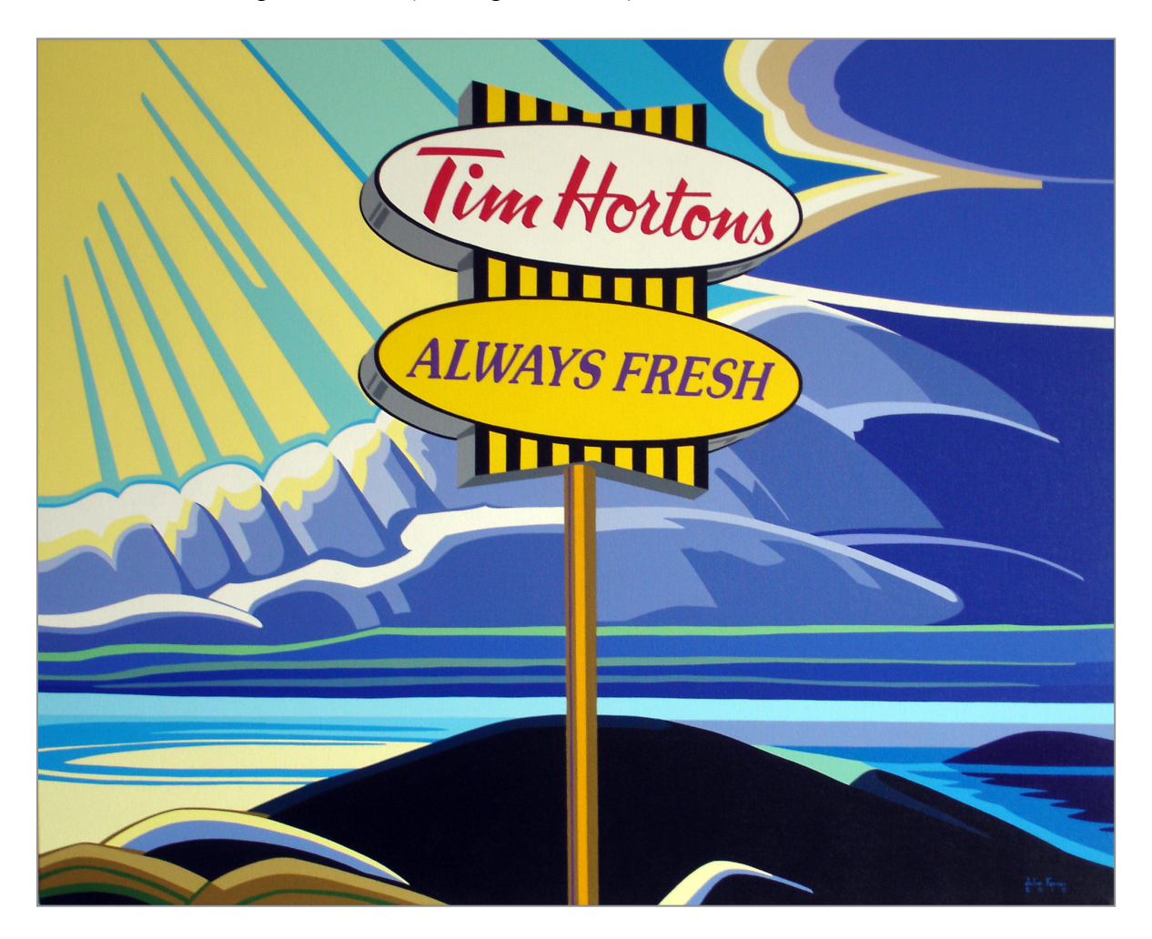
Figure 16 – Untitled – By: Julio F. - 2012

After living in Canada for a little while and learning about the Canadian world, I started merging my Cuban identity with my newly emerging Canadian one and made these print works. (See Figures 16-19)