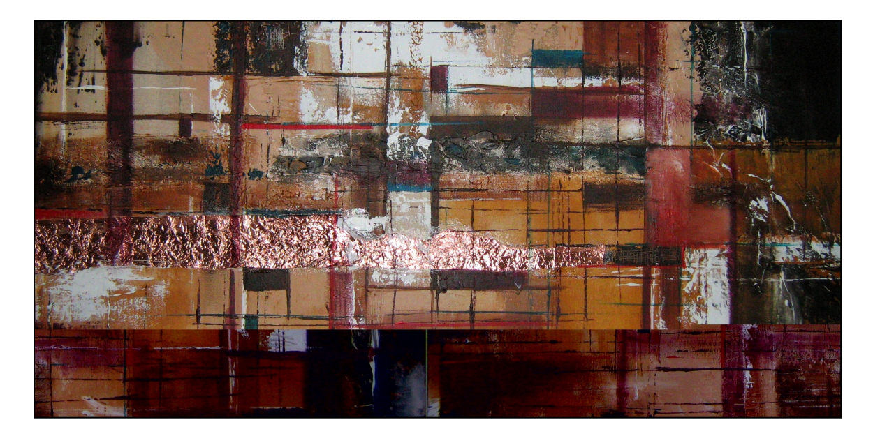
Figure 6 - The city - Acrylic on canvas – By: Sara (F.K) - 2010

I always perceived Toronto as a very clean city full of straight lines, very organized. This painting shows movement, snow, roads, business, even darkness, dark and grey is the areas of unknown-ness for me, I guess it was a way for me to picture my days in Toronto. (See Figure 6)