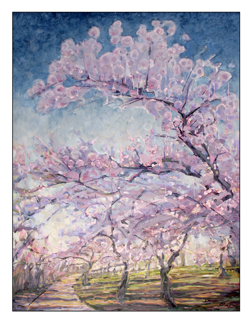
Figure 2- Spring Forward - Oil on Masonite – By: Shinya – 2014