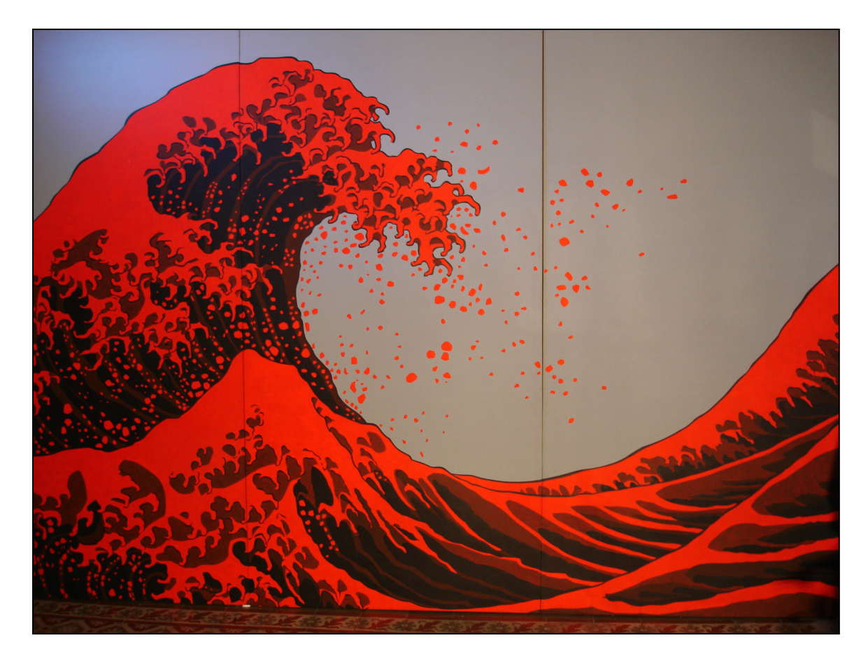
Figure 1 - Red Wave - By: Julio F - n.d.

hand that had an entire page with a picture of a red wave (see Figure 1).