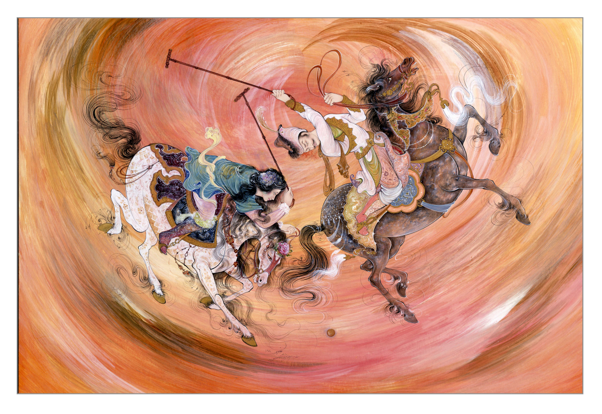
Figure 21 - Choga (Polo) – By: Alija A. - n.d.

Shannon recalls her first attempts to paint in her first days of living in Canada: