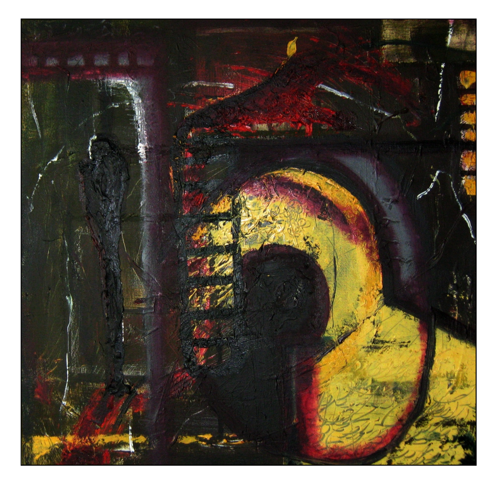
Figure 9 - Untitled – By: Sara (F.K) - 2008

Sara remembers all the layers of colour she used in creating a particular piece; one