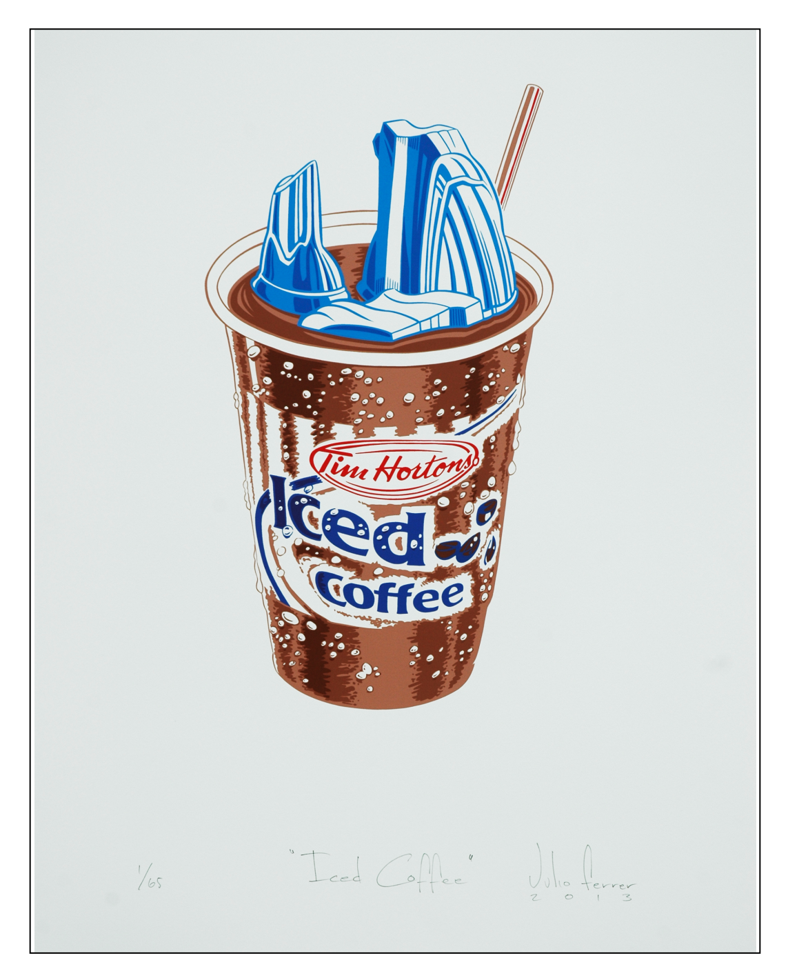
Figure 18 - Iced Coffee - By: Julio F. - 2013