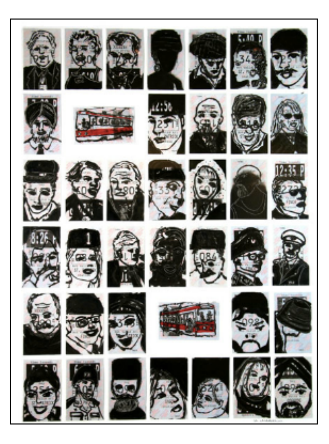
Figure 24 – Subway – Heat on TTC Subway Transfers – 28 x 20 – By: Shannon (Sh.Sh) - 2005