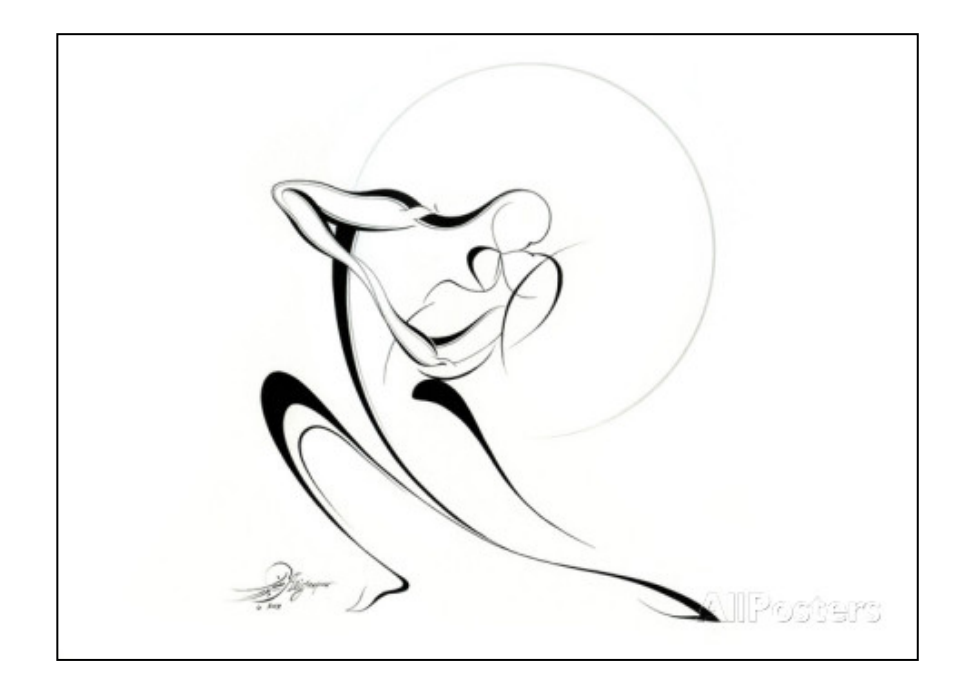
Figure 27 - The United Couples – By: Alijan A. - 2014