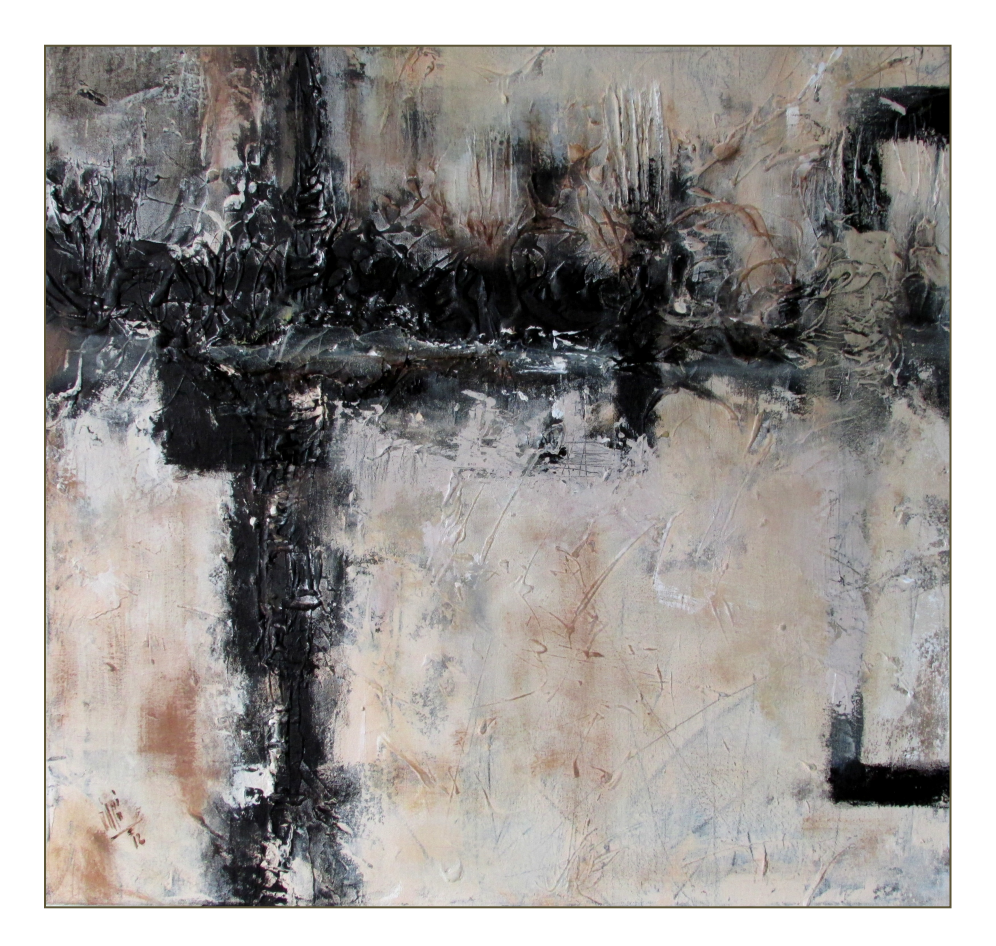
Figure 7 – Obstacles - By Sara (F.K) - 2012

without really being conscious about it makes me freak out here. I need to think twice and reflect on everything, even the simplest act of talking is the hardest act for me now. I always think every step I take might be misinterpreted. I've lost my confidence and bravery, and that is a different identity for me. I feel like I'm a newborn in a mature body. I was 35 when I migrated here and I feel like I have to build everything from zero. I feel like I'm stuck in an in between world. I haven't been able to build what I had before, what I was, and yet I haven't turned into a complete new person either! It's a new world with so much unknowingness and directness-less. I'm always worried of losing, of being lost. I don't know the norms, the rules here. And I was trying to picture all these feelings in my work.