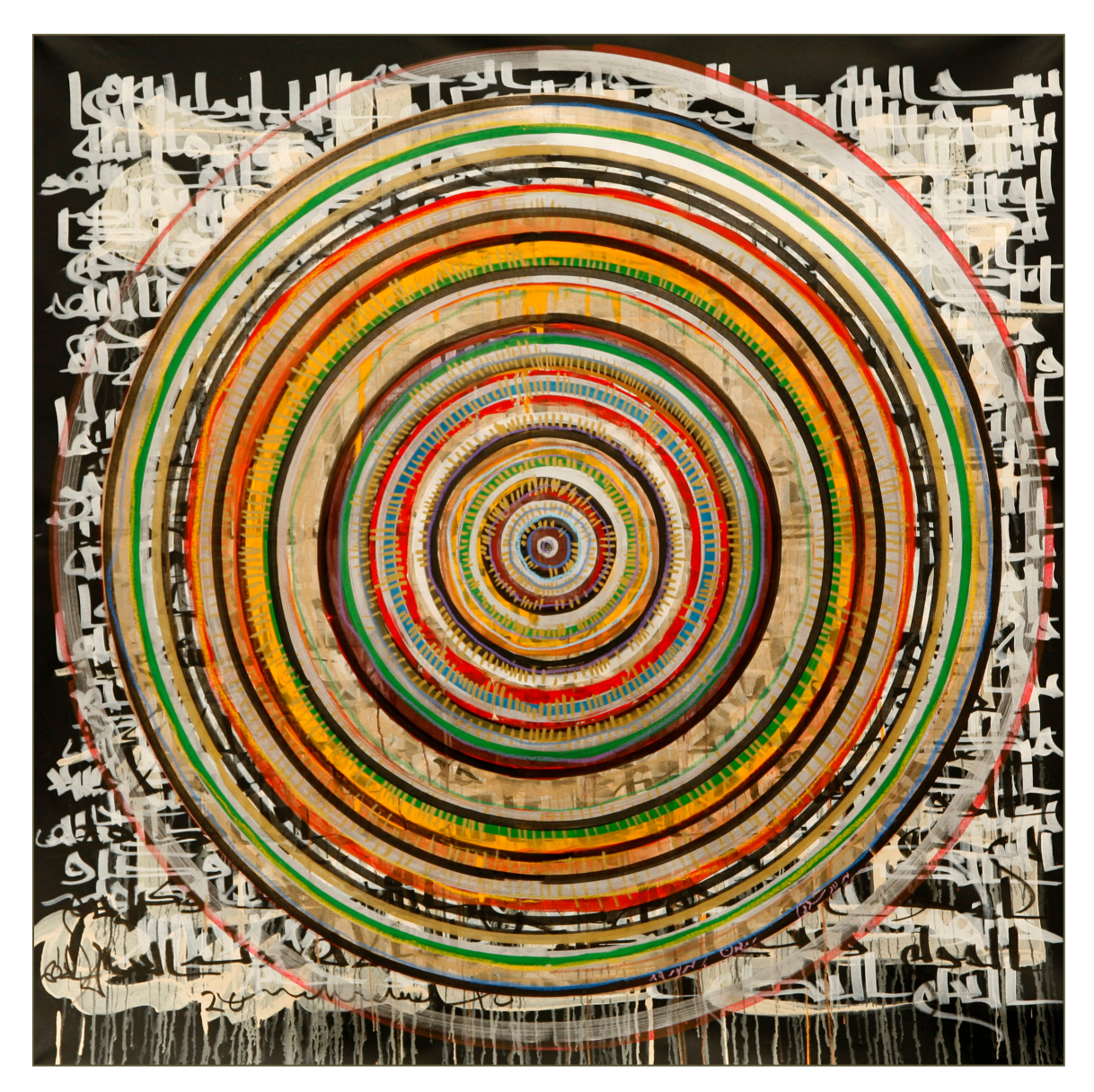
Figure 14 - Untitled - By: Mike (M.Sh) - n.d.