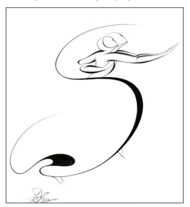
Figure 28 - The United Couples- By: Alijan A. - 2014