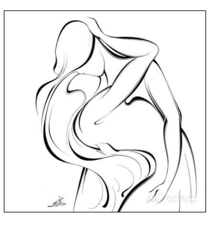
Figure 26 - The United Couples – By: Alijan A. - 2014

Alijan claims that, after migration, and due to exploring his being in a new home, he was able to create a series of work registered globally under his name and labeled "united couples". Each of these series of works employs a new style of figure painting, which is dramatically different from his previous style of art. (see figures 26-28)