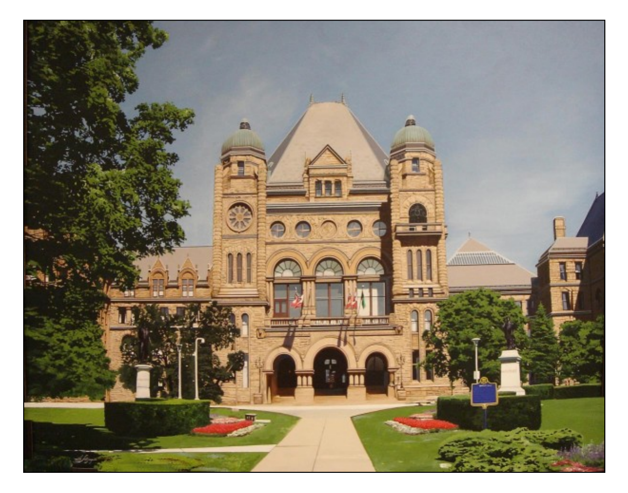
Figure 4 - The Queen's Park Parliament Building - By: Alijan A - 2012

When I was in Iran, I was part of the Modern Art Museum Jury group and my art pieces have been exhibited across Iran, and in the Tehran's Modern Art Museum. My main branch and style is Persian Miniature. I have exhibited my work internationally. I have won several awards. When you live in Iran you are in your own artistic atmosphere, but when you migrate you become international, and need to know what to do to be accepted in the international art community.