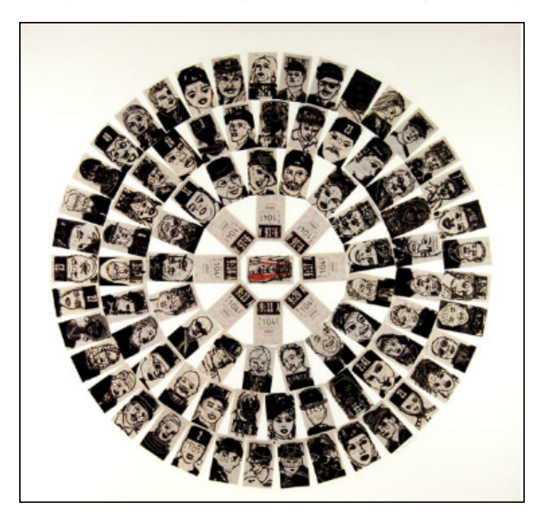
Figure 25 - Rendezvous - Heat on TTC Transfers - 40 x 40 – By: Shannon (Sh.Sh) - 2005