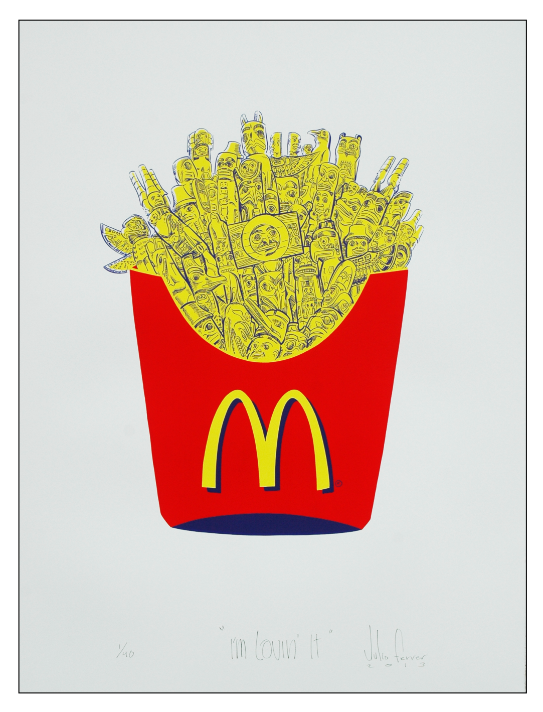
Figure 17 - I'm Lovin' it – By: Julio F. - 2013