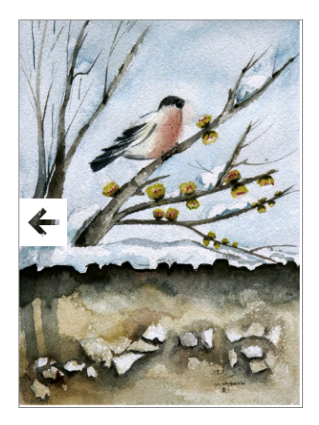
Figure 22 - The Persian Ice Tree – By: Shannon (Sh.Sh) - n.d.