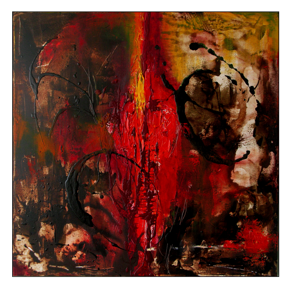
Figure 8 - Confused – By: Sara (F.K.) - 2011

days. I think it's obvious in my work too. Do you see how much movement there is in it? You won't be able to keep your eyes on one spot!