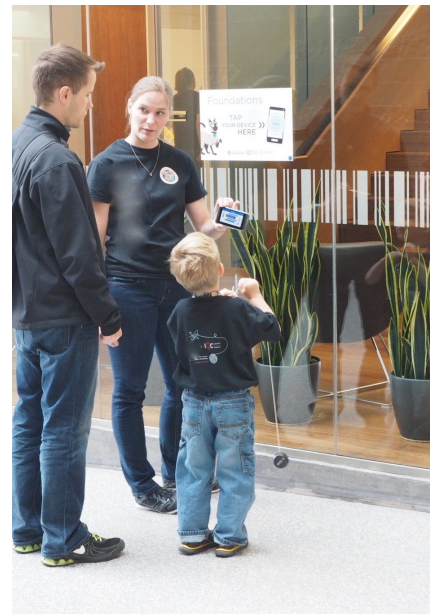
Figure 5: An open house volunteer demonstrates how to scan an NFC-enabled poster for Alice and Schrödinger’s Excellent Adventure using a guest’s smartphone.

As previously mentioned, poor WiFi reception within the building limited the amount of data we could collect (e.g., real-time usage) for the locative game Alice and Schrödinger’s Excellent Adventure. These limitations meant that all content was downloaded to a player’s tablet or smartphone prior to gameplay, and we had to rely on experience sampling over the course of the open house to determine how well the game served its purpose of providing a deeper learning experience during the event.