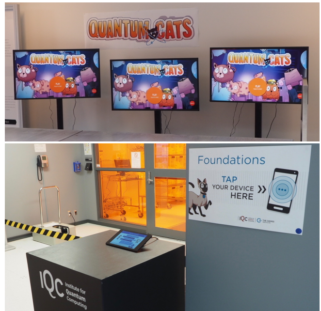
Figure 1: We implemented two games to support scientific outreach. (top) Quantum Cats, an Angry Birds-like game that introduces guests to basic quantum mechanics. (bottom) Alice and Schrödinger’s Excellent Adventure, a locative game that teaches guests about the IQC’s research, staff, and facilities.

Multi-surface and multi-space scientific outreach applications have the potential to help educate the public about local scientific activities, to act as a ‘honey pot’ and draw in otherwise uninterested audiences [5, 18, 20, 22], and to take advantage of