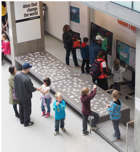
Figure 4: Quantum Cats was played throughout the day by visitors. In front of the displays, Quantum Cats-themed stickers were handed out to visitors at no cost.

we observed that players frequently did not understand that to ‘activate’ the cat’s ability one needed to tap the screen. This usability issue was identified as a priority in our next development iteration. Second, the IR touch frames that we used for the installation occasionally started generating spurious ‘ghost’ touch points. While we were unable to diagnose the issue on-site, we found that rebooting the iStick hardware resolved the issue temporarily; a procedure we followed throughout the day as needed to keep the games up and running.