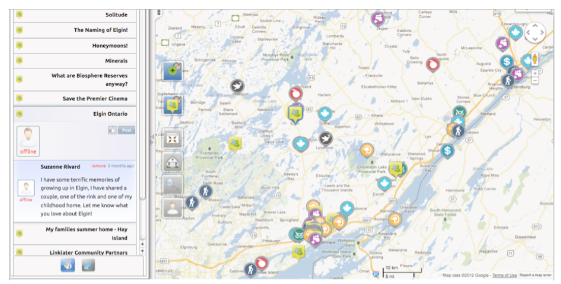
Figure 2: Kawartha Heritage Conservancy interface

The third case study represents a collaboration between researchers at the UBCO, the Central Okanagan Food Policy Council, the British Columbia Interior Health Authority, as well as a number of local food related organizations, farms, markets and outreach groups (Brennan, 2012; Wright, 2012). The Central Okanagan represents an interface-community, where the rural (producer) and urban (consumer) populations exist side by side. Increasingly people want to better understand how and where their food is grown, processed and sold in order to