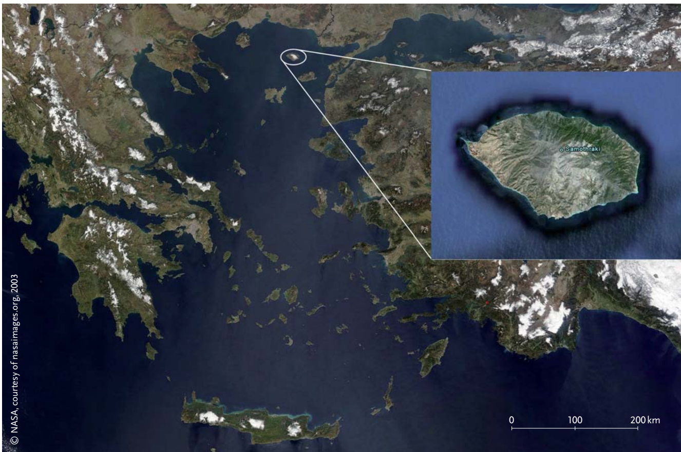
FIGURE 2: The Greek island of Samothraki and its location within the Aegean Sea.

times the island played an important role in maritime trade, the evidence of which can still be found in the picturesque remains of towers and fortifications. In the 19 th century, Samothraki was forcefully depopulated by the Ottoman army and in 1912, it became part of the modern Greek state.