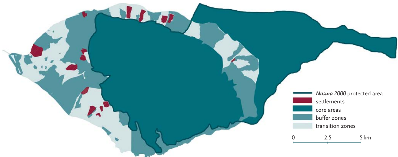
FIGURE 3: Zones of the planned Samothraki UNESCO Biosphere Reserve, including the marine extension of the Natura 2000 protected area. The initiators are confident that the project will contribute to conserve the island's valuable natural assets while maintaining or increasing the livelihood of the residents.

Samothraki's rich fauna includes 15 mammal species, 27 reptile and amphibian species – e. g., snakes, lizards, and rare fresh water turtles endemic to Greece (Broggi 1988, Buttle 1989, Clark 1991, Cattaneo 2001) –, and 156 bird species. Most of these are observed during migration stops on the island. The Greek Ornithological Society is active in implementing annual observations and monitoring of bird populations (Hellenic Ornithological Society 2007). The seas surrounding the island feature high biodiversity. Deep sea trenches up to 1,000 meters deep are considered highly important for populations of rare and endangered marine mammals such as dolphins and whales. Also the Mediterranean monk seal ( Monachus monachus ) and the Mediterranean sea turtle ( Caretta caretta ) are frequent visitors to the area even if they do not breed there (Frantzis et al. 2003).