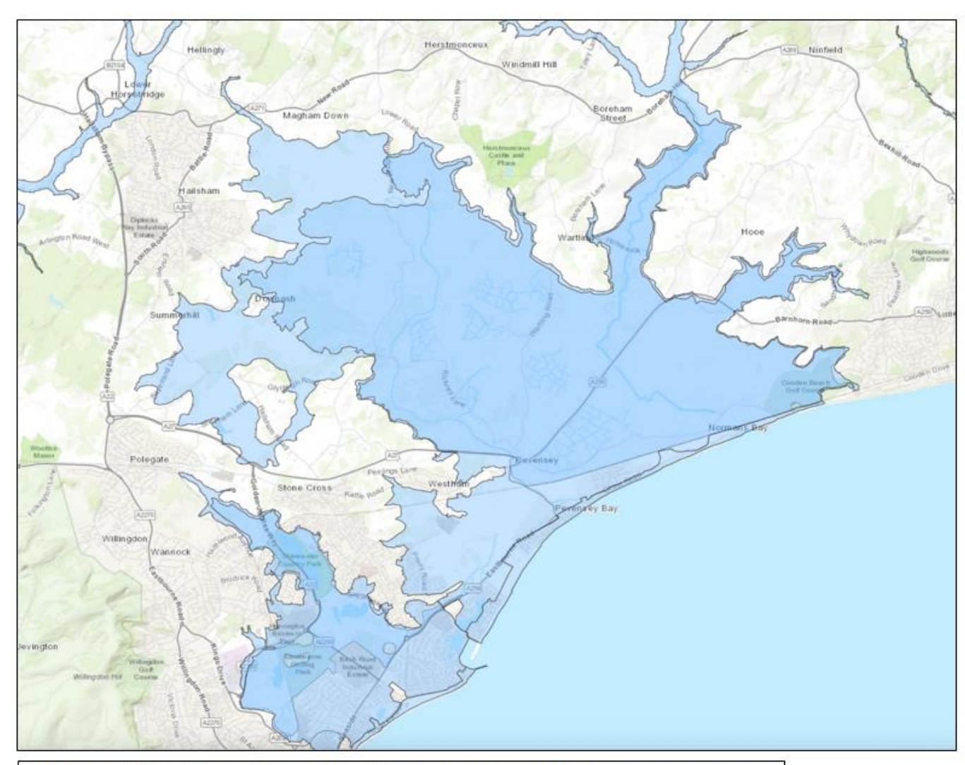
Appendix 1: The Pevensey Levels Prior to Reclamation