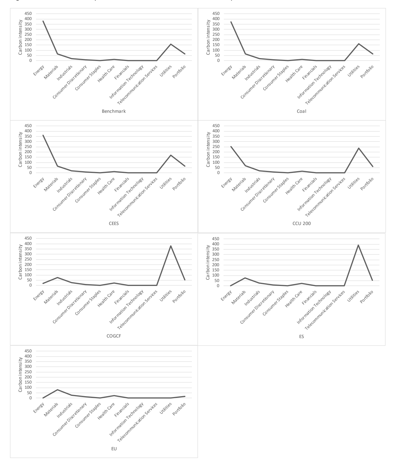
Figure 3: Carbon intensity of the benchmark and the divestment portfolios