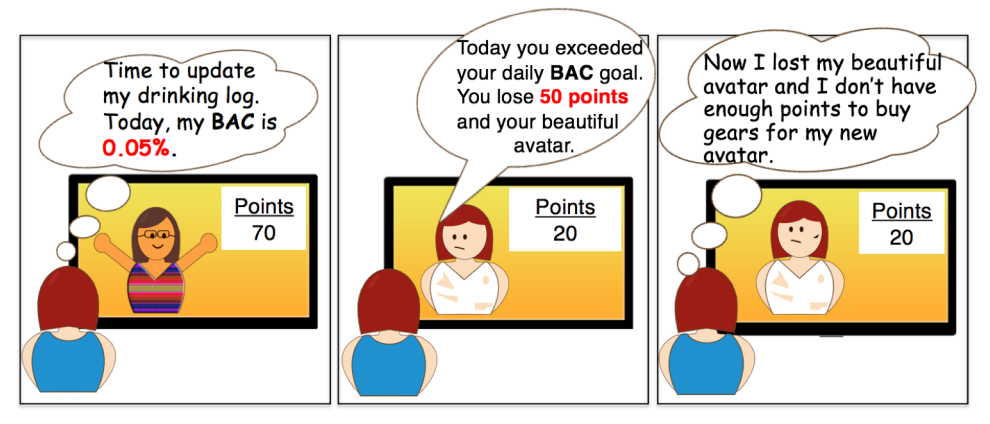
Figure 1. Storyboard illustrating the punishment persuasive strategy.

different strategies ("What strategy does this storyboard represent?"); and second, to describe what is happening in the storyboard in their own words ("In your own words, please describe what is happening in this storyboard"). We also included 24 items for assessing the Hexad gamification user types [77] and questions for assessing the participants' demographic information and drinking behaviours.