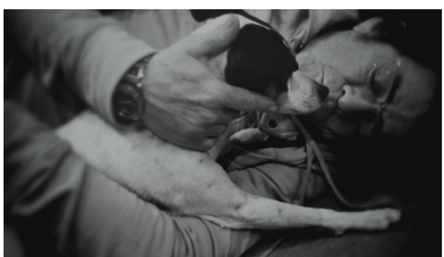
Figure 30. Heart of a Dog: Image 12