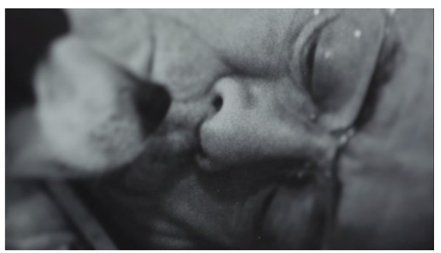
Figure 32. Heart of a Dog: Image 14

It is based on such an irreplaceability that I use the word (dis)consolation . Such a concept points to an initial denial of mourning but ends in its avowal. However, the echoing "love will turn the time around" heightens the sense of ellipsis: a continuous and echoing figure that such a consolation has at its core. The echoing consolation of love, in the form of "turning time around" is something of a (dis)consolation, by which I seek to emphasise the continuous nature of consolation. Love consoles, but it will not turn the time around. We can't but submit to the resonance of such an imaginative expression, which gives voice to the dead. The absence of Lou