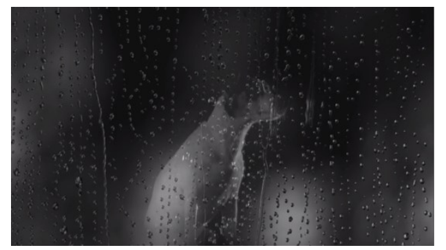
Figure 23. Heart of a Dog: Image 5