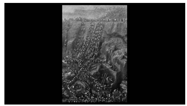
Figure 1. The Salt of the Earth" Image 1

characters. Here, for instance, we are given the image, in the foreground, of a man in a freezeframe leaning on what appears to be a dead tall tree trunk while in the background hundreds of labourers are busy searching for gold at the mine. This is the first instance of exhausting and, hence, destroying the earth and its resources, observed for the rest of an hour and fifty minutes. We hear the voice-over reflecting "all this earth had to be removed." Apart from disappearance of nature, one further cause of grief is that it is, in fact, man who is doing horrendous things to fellow men and to nature. This is an image over which Salgado comments, stating, "I saw before me, in a split second, the history of mankind." Right from the outset, Salgado speaks of the plights and pains of people and also about exhaustion of the earth and, in this sense, he is massively inclusive. The stills portray a few nameless characters. Salgado's reference to "the history of mankind" foreshadows the universal scale of the film. But how? First, this longduration shot foreshadows how man exhausts the earth's resources, destroying the forests, and secondly, it presages how people live in hard man-made conditions, in extremis (Fig. 1-2).