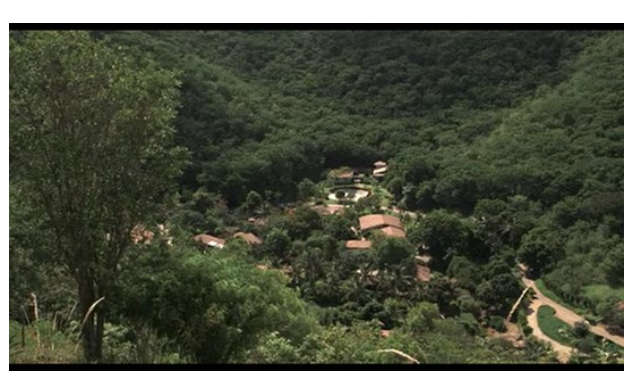
Figure 15. The Salt of the Earth: Image 15