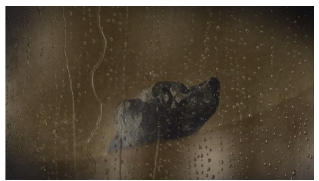
Figure 24. Heart of a Dog: Image 6

The only instance when Lou Reed, another lost beloved, appears in the film, is through the eyes of Lolabelle in the Bardo . While we see all the memories and dreams, the film continues its funeral chimes and the last memory, that of Lola, Anderson and Lou Reed on the beach, fades into the sea and waves and the sound of chimes gives way to the sound of waves. It is exactly after this last memory where chimes are replaced by the sound of waves fused with very few seconds of a music in which Anderson is heard singing. It is here that the waves fade into the blurry rainy pane and the image of the pane, in turn, cuts to typewriter keys, marking the end of Lolabelle's presence in the in-between realm of the Bardo .