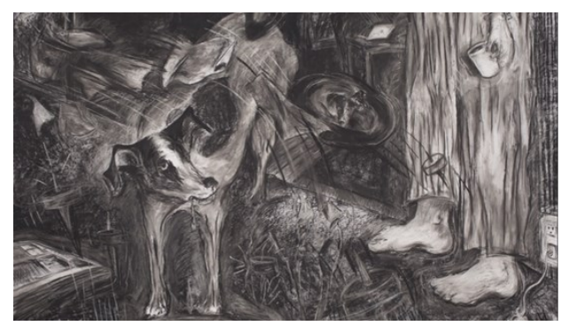
Figure 27. Heart of a Dog: Image 9