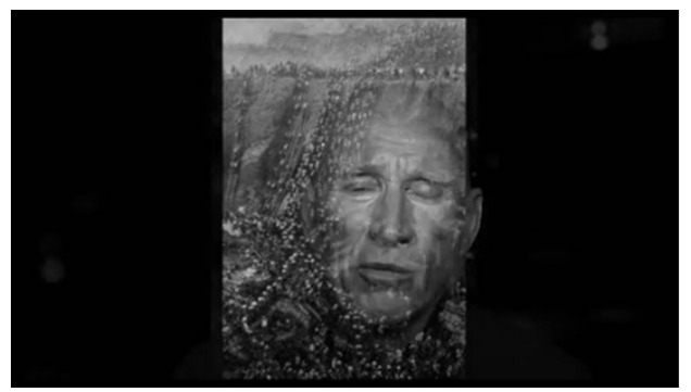
Figure 6. The Salt of the Earth: Image 6