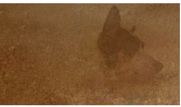
Figure 22. Heart of a Dog: Image 4