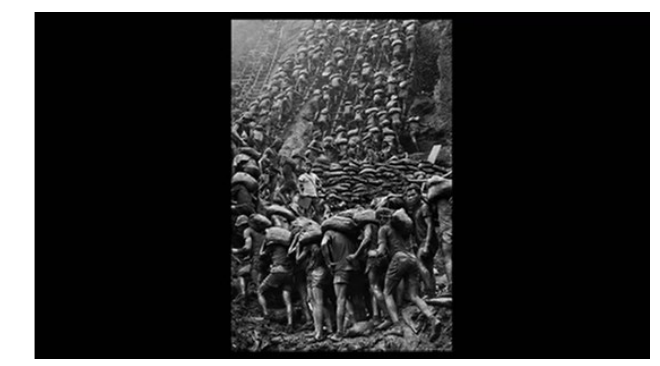
Figure 2. The Salt of the Earth: Image 2

Such an inclusivity can equally be illustrated in a collection of photos, the first of Salgado's, of Brazil, in which we see loss of private lands. We witness the same fate to Salgado's family land the same way that the earth suffered at the hands of man in the "Babel."