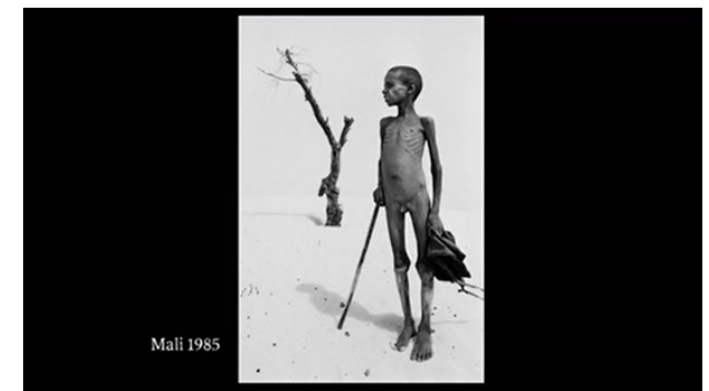
Figure 4. The Salt of the Earth: Image 4