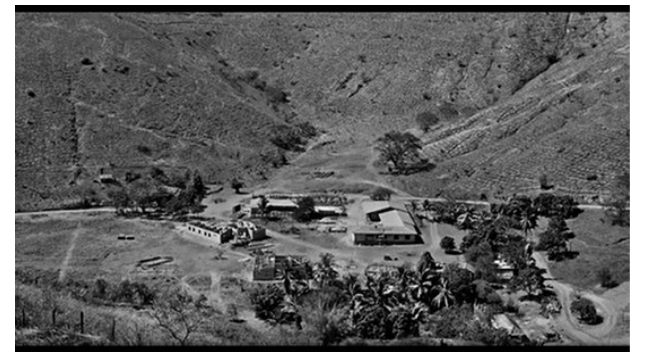
Figure 13. The Salt of the Earth: Image 13

This interconnectedness is achieved through montage. Let's recall that Deleuze defined montage as "the whole" in which "a change" takes place. In non-Deleuzian terms, this whole is the interplay of all the elements in the film including shots, scenes, collections from Salgado and moving images which produce a whole at the end. Change, on the other hand, refers transitions, to cuts, to sound bridges which allow the film to move forward and, as I said, this cinematic "change" coincides with the elegiac transformation from mourning to consolation. Let's also remember that the film's mode of montage is convergent yet "open." Cinematically, the film reaches the height of montage in a move that unifies or, to use a word by Deleuze, "converges" in the form of a superimposition. Technically, the zenith of an attempt at offering solace, manifested in the resuscitated forests and the new landscape photos of Genesis , takes place with the aid of a photographic revelation, by superimposing the green image of the restored lush forests on the black-and-white image of the old deforested lands during the drought (Fig. 13-16).