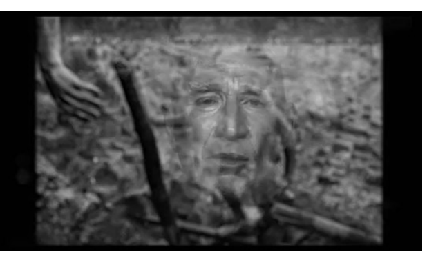
Figure 7. The Salt of the Earth: Image 7