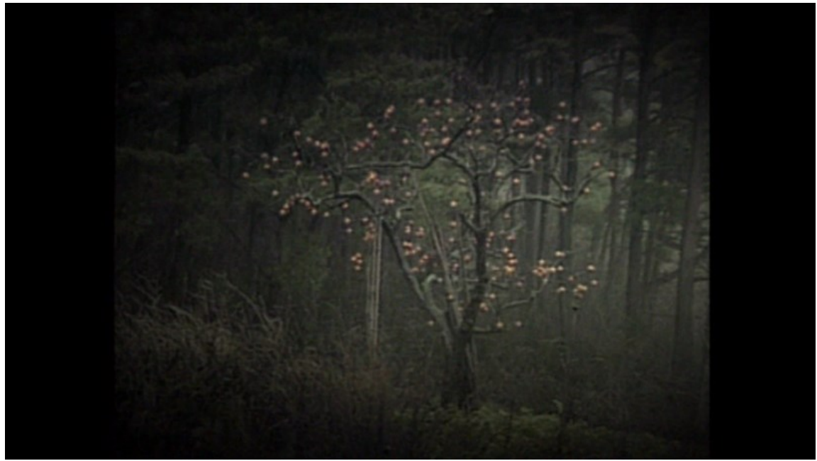
Figure 43. Oriental Elegy: Image 11

over by the final emphatic "I shall stay." These words, coupled with the music and the blackand-white cinematography, heightens the elegiac in the film.<sup>53</sup> (Fig. 43)