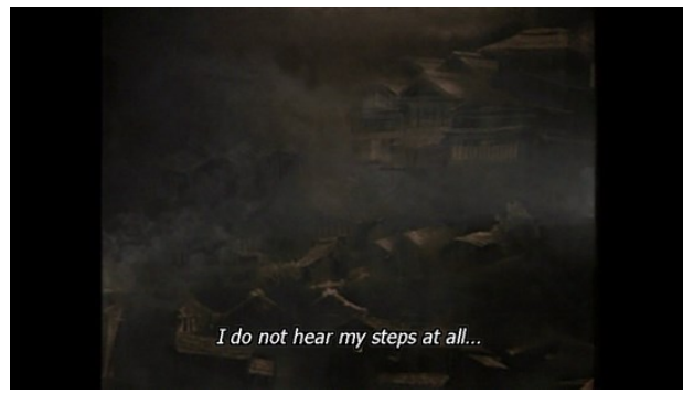
Figure 35. Oriental Elegy: Image 3