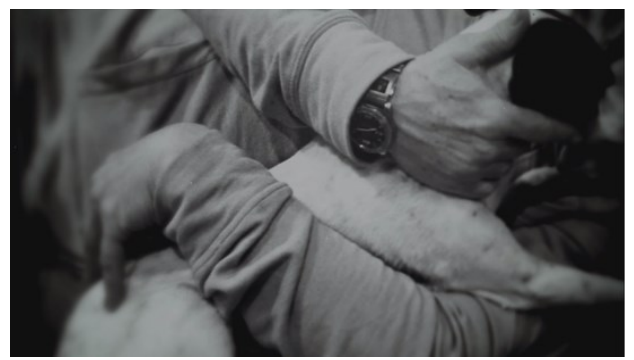
Figure 29. Heart of a Dog: Image 11

last photo of the film (Fig. 29-32). In elegiac terms, the song speaking of love coupled with the photo illustrating love offers solace. However, even if we concede that love can indeed "turn the time around," it would still be irreplaceable, for nothing can compensate for any of those losses.