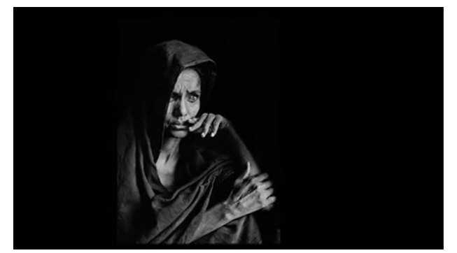
Figure 17. The Salt of the Earth: Image 17

However, we cannot disregard Wenders's unequivocal statement that "after all, people are the salt of the earth" when he is looking at a picture of a Tuareg woman (Fig. 17), taken by Salgado, a picture that precipitated this whole cinematic project, The Salt of the Earth (Fig. 17). If, indeed the photographer and his art are one and the same as the film seeks to communicate to us, and if the lost ones are given a voice through the photographer, then it would make little difference to make a distinction between the two because ultimately "people are the salt of the earth." (Fig. 17-18)