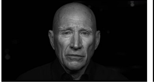
Figure 8. The Salt of the Earth: Image 8