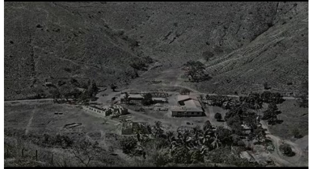
Figure 14. The Salt of the Earth: Image 14