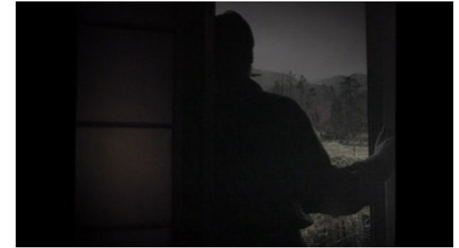
Figure 44. Oriental Elegy: Image 12