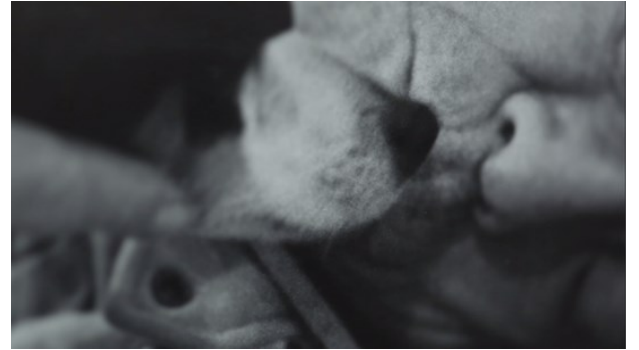
Figure 31. Heart of a Dog: Image 13