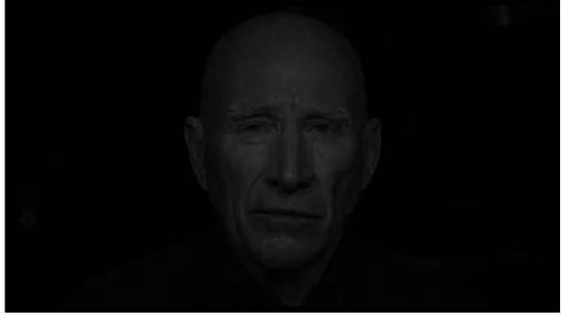
Figure 9. The Salt of the Earth: Image 9