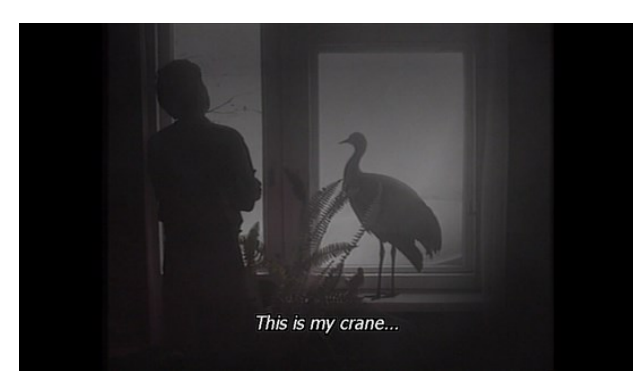
Figure 46. Oriental Elegy: Image 14