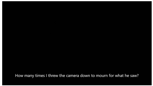
Figure 10. The Salt of the Earth: Image 10

Capturing moments and frozen within frames, a photo is a closed system which gives voice to the absent -- it is the montage that allows them to interconnect and be a part of an open system. This voice-giving is what prosopopoeia does. The closed system of photos is especially