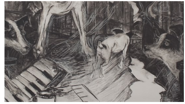
Figure 26. Heart of a Dog: Image 8