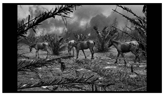
Figure 5. The Salt of the Earth: Image 5

Similarly, in a collection called Workers where the film pays "homage to men and women who built the world around us," we witness the suffering animals undergo. The one group of photos Wenders focuses on here is Kuwait where we observe the destruction of birds, animals, trees and green farms. Workers , shot during the first Persian Gulf War, shows a land "ruined by war," as we hear Salgado narrate. Salgado comments that there were lots of "horses, thoroughbreds that had gone completely, desperately insane," adding "animals are the first to flee a catastrophe when they are free to leave, but here they weren't. There were birds there too… . Birds couldn't fly anymore as their feathers were stuck together" (Fig. 5).