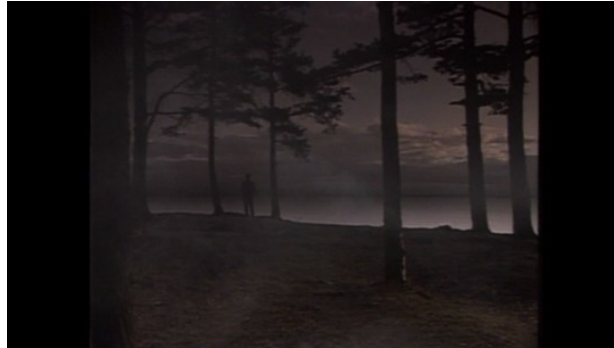
Figure 33. Oriental Elegy: Image 1

entire film, and its blurriness contributes all the more to this dream-like ambience, as the voiceover and the image are converging forces, heightening each other's force (Fig. 33-36). <sup>52</sup>