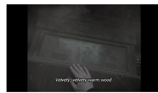
Figure 37. Oriental Elegy: Image 5

However, the most intense presence is somatosensation, the sense of touch and cognition through this sense, which operates through hands throughout. The speaker touches the windows of the dark house, the windowsill, even at one point the air. In one example, the camera picturing one of female characters dissolves into an extreme close-up of fingers – it's not clear whose -- which are touching what seems to be a tree bark, staying on this image for thirty seconds (Fig. 37-38).