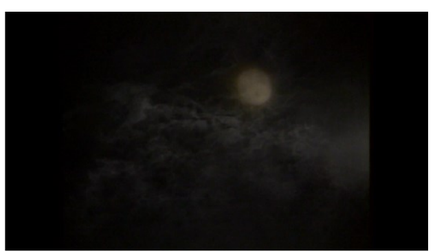
Figure 36. Oriental Elegy: Image 4

That the film is a dream is one of the first realizations the viewer comes to. A simultaneous revelation is that the narrator is exploring, indeed, is on a quest. But is there any indication if the man indeed is in search of knowing? And what kind of knowledge does he seek? A strong aura of sensory experience presages exploration of knowledge. There seem to be only two key occurrences, apart from a realization about this dream in Oriental Elegy , in these beginning parts. One is that the narrator seems melancholic and the second is the strong presence of sensory experience. However, he speaks about his sorrow when he realizes he doesn't have