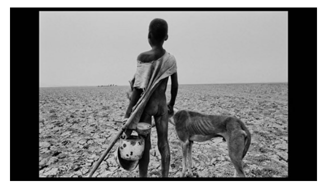
Figure 3. The Salt of the Earth: Image 3

The loss of animals is an important public loss in the film. Animals figure prominently throughout, when they are used by man to exhaust the earth and when they die because of man's actions. For example, when the three men, the co-directors and the photographer, have a journey to the Arctic Ocean, to "photograph the last big congregations of walruses," portraying a species which seems to be disappearing, we see the first instance of death in the film: a dead walrus on the shore here, heightening the sense of extinction. The Salt of the Earth portrays this death even before the countless human losses it depicts. Even in Brazil when Salgado's loss of family lands, and public rainforests is predominant, we hear him lamenting, "there were a lot of cattle here but they are all gone now," adding "this land was so plentiful, there were lots of birds, canaries, and ticoticoes, blackbirds." In Africa, similarly, animals are shown to suffer and perish along with their human companions. In one profoundly revealing picture, a small child is shown to be facing the same fate as his dog. We hear Salgado speaking with a wire of grief in his voice about the child who, having a guitar in his hand, is milling the desert "with his dog" (Fig. 3).