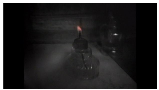
Figure 40. Oriental Elegy: Image 8

This image subsequently cuts to a medium close-up of an oil lamp which is almost burned out and is slowly and dimly flickering (Fig. 40). Juxtaposition of these two images