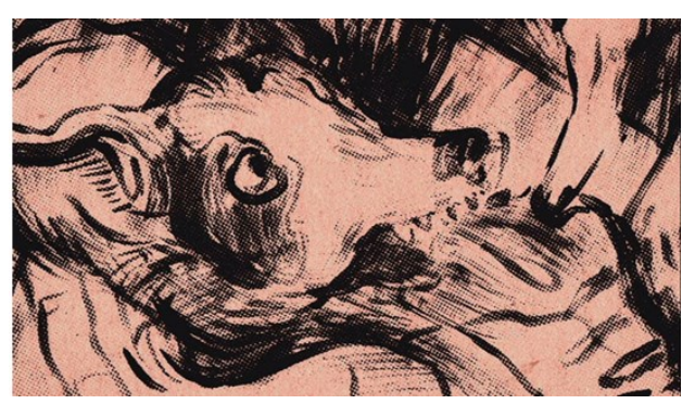
Figure 20. Heart of a Dog: Image 2