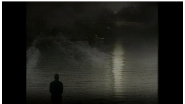
Figure 34. Oriental Elegy: Image 2