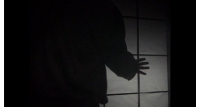
Figure 41. Oriental Elegy: Image 9