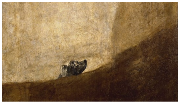
Figure 21. Heart of a Dog: Image 3