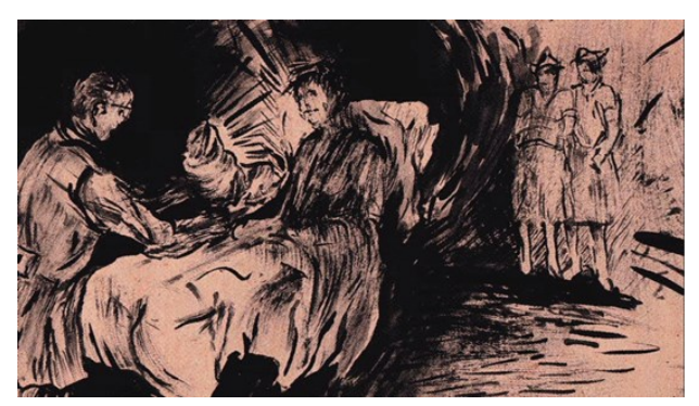
Figure 19. Heart of a Dog: Image 1