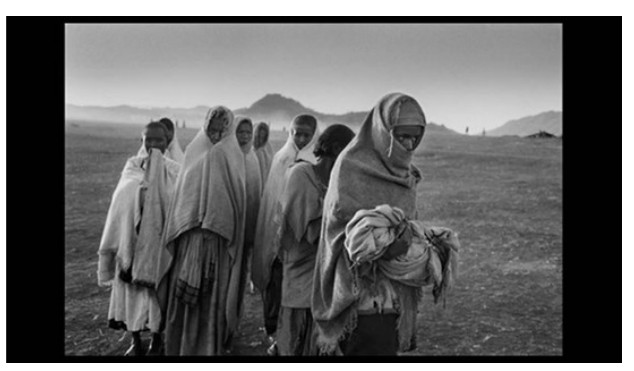
Figure 18. The Salt of the Earth: Image 18

The central premise in The Salt of the Earth is that photography and film are each a means of memorializing the absent ones and are, hence, elegiac. The film converges and brings together to the point of imbrication, different objects of loss which include man and nature and their separation from each other. The film, similarly, offers a solace in the form of art and nature and the possibility of the continuity between man and nature. Montage provides a vehicle for the