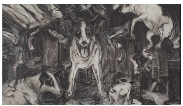
Figure 28. Heart of a Dog: Image 10

These paintings are in black-and-white and follow one another in freeze frames. Lolabelle can be seen everywhere in different states and sizes. In one shot, we can see Lola at the piano on the left while another Lola can be seen on the right gazing at the left Lola. Two other images of the dog can be observed in this frame: one showing Lola's back and another focusing on her larger-than-life hind legs only. The paintings, and the ways Lola appears in them are reminiscent of the impressionistic world of dreams (Fig. 25-28). We know that Anderson paints her dreams; her book Night Life is an attempt to reflect her real dreams in visual form. Anderson is there in her paintings of the Bardo not only in the visual form, but we hear Anderson singing about her dog. This blending of visual and aural effects in which the narrator and the dog meet, in what resembles a reunion, is an act of intense remembrance. Music and painting, both Anderson's works of art, are coupled to reinforce the intensity because forgetting, as we were told during the "crib death" metaphor, happens at the most intense moments. The visual effect of the pane with the rain is back again here, heightening the sense of the Bardo in dream. There seems to be a play on the homophones pane and pain . While the pane reflects Anderson's pain, the visual effects on the former lead to the disappearance of the latter through Anderson's bardo in which she does painting.