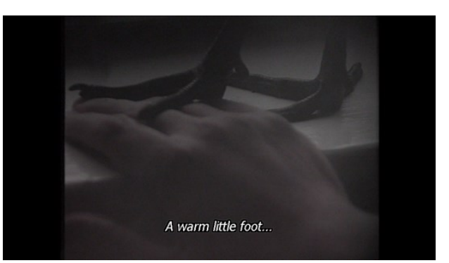
Figure 47. Oriental Elegy: Image 15

Overall the tone of the narrator and the interviewees is terse, allowing the image to speak for the image. In her book, Wisdom and Metaphor , Jan Zwicky, quotes Charles Wright as saying "The true image raises out of the darkness ...the true image belongs to neither Imagism nor Surrealism. It belongs to Emptiness. Which is to say its power is otherworldly and ultimately apophatic, a luminous outline above the tongue" (72 Right). Encountering riddles of life, the narrator cannot but resort to saying little. The voice-over, constituting the whole narration, is like an extended narrative poem, slow and somber. This script is similarly very succinct; questions are asked, short answers are offered and curt descriptions are provided.