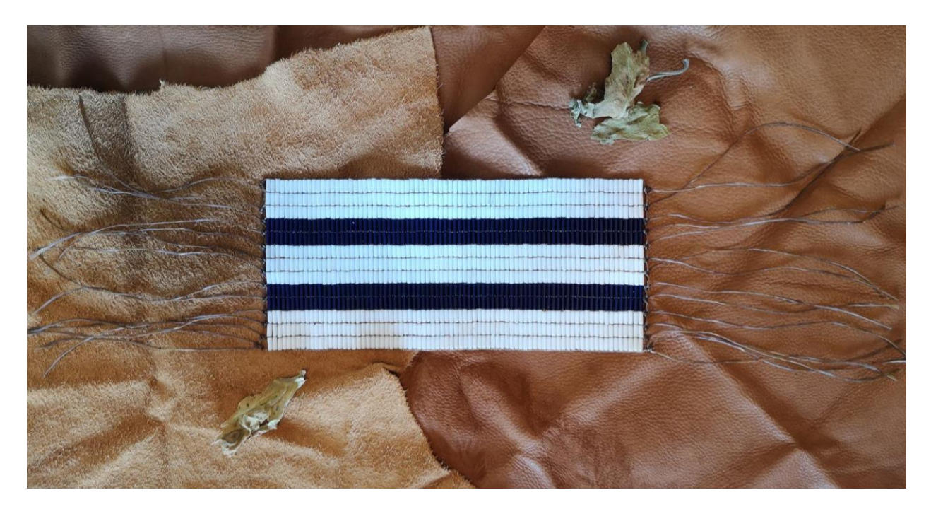
Figure 2: Tékeni Teiotha'tá:tie Kaswéntha on elk and deer hide with dried tobacco.

representative of a Dutch (or European) ship. The three strands of white beads are all representative of the 'river of life,' comprised of peace, good mindedness, and strength. The purple strands remain parallel with one strand of white in between, representing how each vessel may carry through the same waters while each tending to their own matters in a 'brother to brother' relationship without the interference of each other (Keefer, 2014).