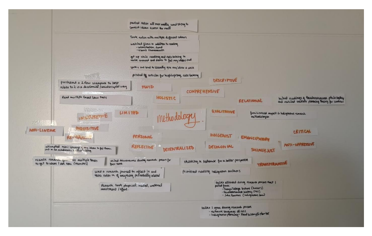
Figure 4: My methodology mind map. Image by Katie Turriff, 2020