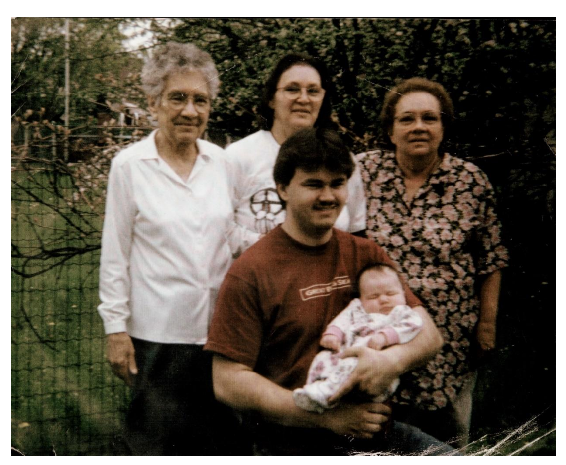
Figure 5 Five generations.