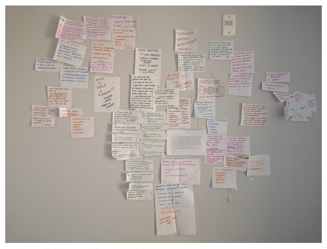
Figure 3: My wall of notes.

This process carried out through a habit of writing in addition to note-taking and ideaorganizing. I would rewrite my research question and problem statement multiple times, each in slightly different ways or with slightly different points, until my work amassed to something more challenging and exciting than before. To this effect, I essentially developed a reciprocal relationship with my work; I would learn from my research, which would develop into notes, which would emit ideas, which I then would consider against my research, and so on. This resulted in a cyclic development of ideas tangling upon each other, which I then pulled through, organized, sorted, and coded to arrange and identify specific relevant themes. With my established habit of writing, these ideas were thoroughly thought through in repeated cycles, which finally developed into this written thesis.