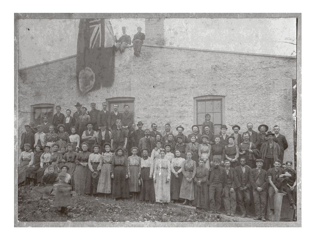
FIGURE 4 Mounted group portrait of employees of the George Pattinson Woollen Mill casually posed in several rows outside of a stone building. Two employees are sitting on top of the building with a flag, and a blurry child is visible walking through the frame at bottom left.

history. This reality has presented an uncomfortable truth: identifying records about equity-seeking and racialized peoples within SCA holdings renders people notable for not having white skin. Because most of the department's archival holdings represent white people and white organizations, the corresponding descriptive records were written and continue to exist in a realm where colour is effectively ignored because whiteness is the assumed default. Why, for example, would an archivist have indicated that an individual or a group of people in a photograph were white if everyone in the photograph was white?<sup>51</sup>