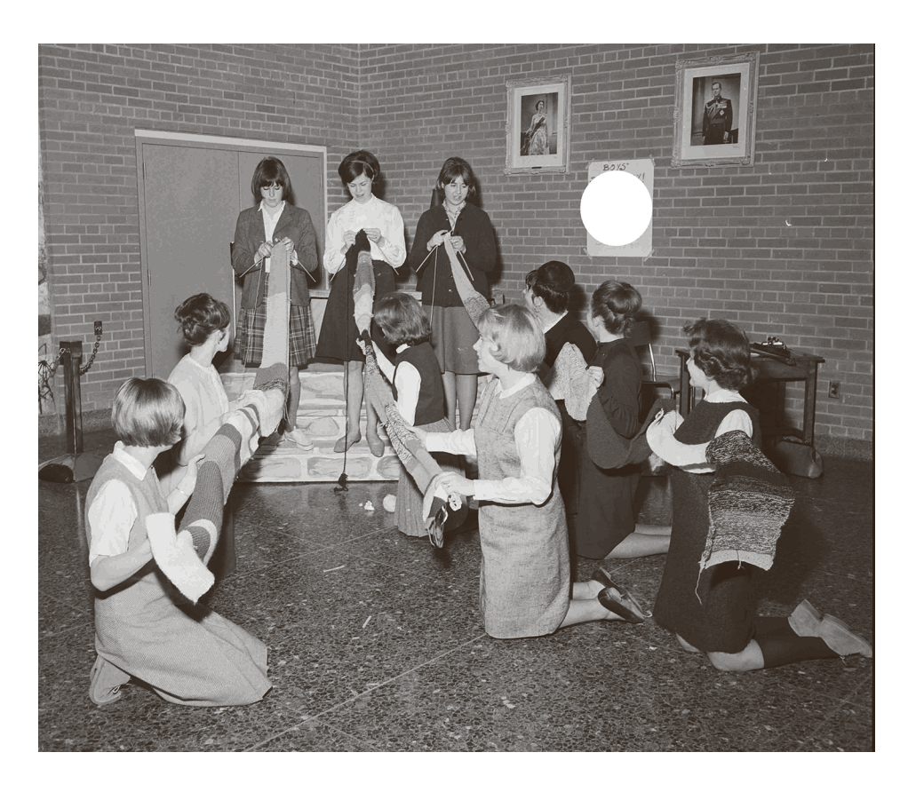
FIGURE 1 Negative from the Kitchener-Waterloo Record Photographic Negative Collection, titled "Waterloo High School Knitting Bee."

Everyone working and studying at this school would have seen it and would have had an opportunity to object to the event. At the same time, while the photographer could have reframed the shot, the advertisement is visible on the wall as if racism is just obvious – a given that no one thinks, or thought, twice about. If we, as a department, had not already been discussing the impact of unacknowledged racist content in the records we publicly share, this may have gone unnoticed, not because we are okay with open displays of racism, but because the poster is relatively small and quietly woven into the rest of the shot, making it easy to miss.