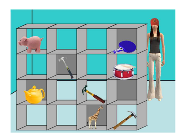
Figure 1. Example of two experimental trials on the computerized perspective-taking task. On the left, a relational trial ("Click on the top hammer."), where to be accurate, participants would have to realize that the top hammer from the speaker's perspective is the middle hammer, as the actual top hammer is blocked from her perspective. On the right, an ambiguous trial ("Click on the bat.") wherein to be accurate, participants would have to realize the speaker was referring to the baseball bat as the flying bat was blocked from view. Computer program was developed by I. Apperly and collaborators.