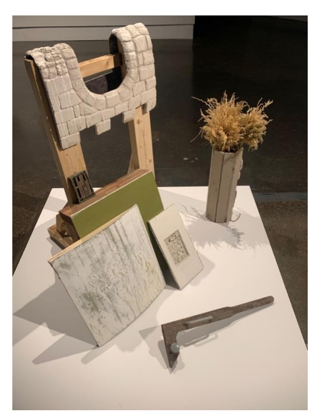
Figure 15. The near small island of take only what you can carry (2022).

There is an island in the exhibition housing a collection of sculptures, primarily composed of pine, plaster, drywall, and XPS insulation. These are the materials that constitute more than 90% of residential housing in so-called North America. Not universal but situated, of this place.