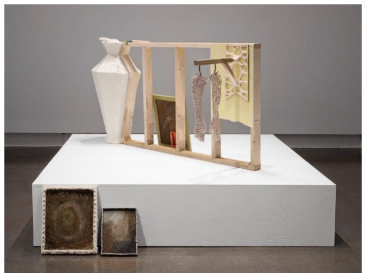
space and time. Incorporating objects into physical narratives. Carrying a stack. Sourced from readily available building supplies, common units that constitute our ambient psychoarchitectural texture. The emotional terroir of where we find ourselves is pressure treated. The care etched into and rubbed over these materials speaks to a want of care for the built world around us.

There are independent structures leaning against each other. The central most figurative shape is Alabaster, who we have already introduced. Alabaster has been framed into a structural wall. His studs are on 16". He has a secret cubby in the part of the vase that would be his shoulder blade. The cubby is housing an ash-coated pinecone from Pompeii.