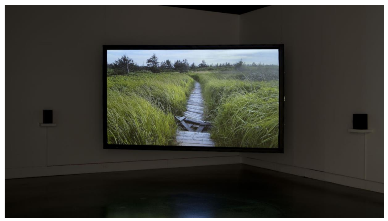
Figure 14. Install view of a policy of neglect (2021).

The boardwalk was indeed long, so long its maintenance had lapsed to the point that Park's Canada considered the path closed. It was astoundingly long, in fact. Looking at a map, the boardwalk is about half a kilometer long. The maintenance alone that it would require to upkeep this path is staggering.