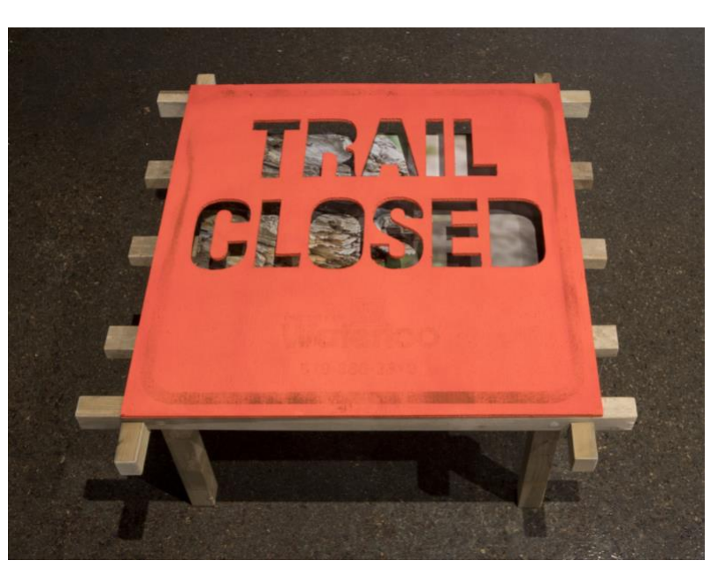
Figure 19. evidence of a habit (2022).

We don't know how to talk about these works as an installation before we install them in UWAG. The work is so ongoing we can't quite see it for what it is.