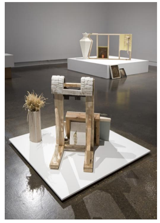
Figure 16. Near small island back view.

Using 2x4 lumber from different eras shed light on a lineage of ideological development with material consequences. Why is a 2x4 today actually 1.5" x 3.5"?