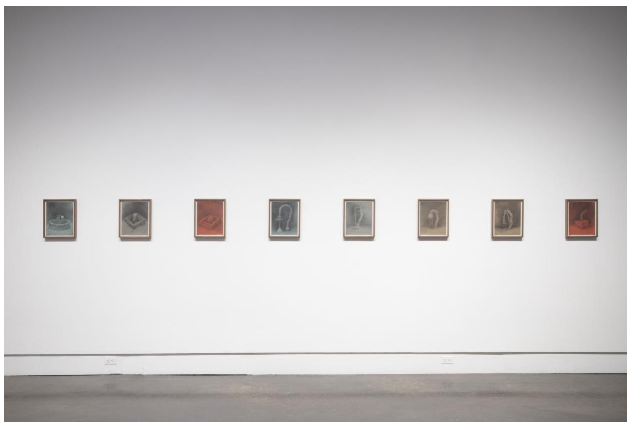
Figure 3. they didn't get stronger, they just got sore (2022).

We decided to frame this series to invest care into works that felt extremely fragile out in the world. Those feelings were both towards the medium of paper and towards the subject matter: the spines look pained, the walls sturdy but old, everything indicates age and weather-wornness, a patina theme picked up materially throughout the exhibition. But the investment to frame was also a mechanism to safely display this work for J, whose connection to drawing as a private means of recalibrating dysregulation goes back to childhood.