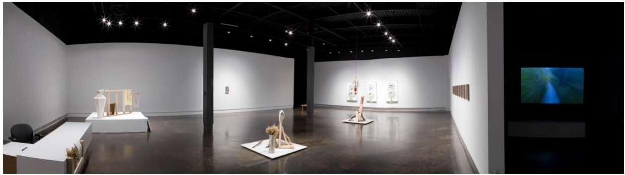
Figure 21. Completed installation in UWAG.

We see economic power as one of the largest life-configuring forces in the contemporary moment. Ultimately, it must be re-imagined in order for new kinds of relationships to be possible. To see our ethics echoed in western economic scholarship is hopeful to us. It helps us to imagine that there is a future.