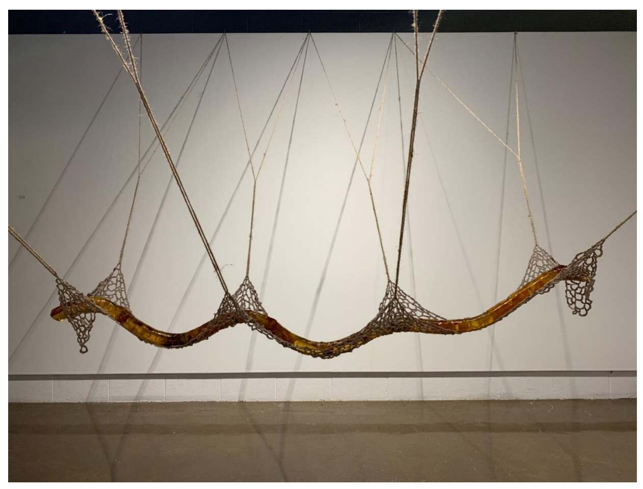
Figure 2. Installation view of keep an ear out, keep an ear in (2021), ballistics gelatine imbedded with dehydrated food consumed for the project suspended in a crocheted linen fascia netting.

J: Maybe it's good to say narratives, or discourse, or stories, are these things interchangeable?