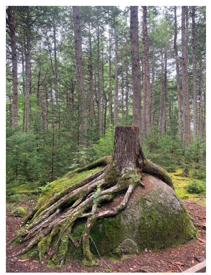
Figure 1. The remains of a tree in Kejimkujik, a traditional gathering site to Mi'kmaq people, a national park to settlers.

scholarship to learn from systems of knowledge whose foundations were established outside of western hegemony. We want to learn to love the land we're on and from, the land of Southern Ontario and The Maritimes, specifically.