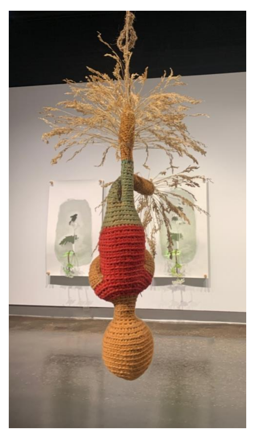
Figure 11. a turning point (2022) (front) and a month of stolen light (2022) (back).

with the printed image facing the wall. The flowers are hand-cut within their print and are falling upside-down and backwards out of their print.