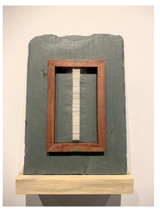
Figure 5. the old me, the old me (2022).