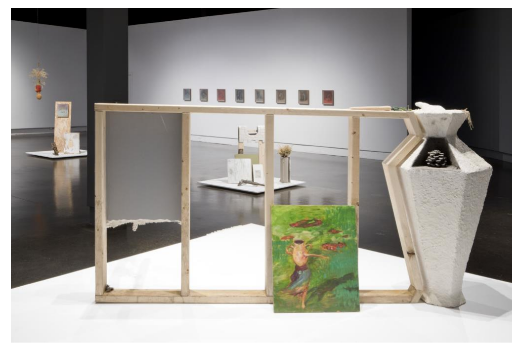
Figure 7. take only what you can carry (2022), back view.

J: Ironically, my mom really likes the show Arrested Development.