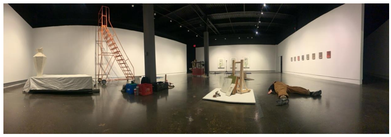
Figure 20. In-progress installation in UWAG.

Degrowth provides a way for us to approach this challenge. It stands for de-colonization, of both lands and peoples and even our minds. It stands for the de-enclosure of commons, the de-commodification of public goods, and the de-intensification of work and life. It stands for the de-thingification of humans and nature, and the de-escalation of ecological crisis. Degrowth begins as a process of taking less. But in the end, it opens up whole vistas of possibility. It moves us from scarcity to abundance, from extraction to regeneration, from dominion to reciprocity, and from loneliness and separation to connection with a world that's fizzing with life.