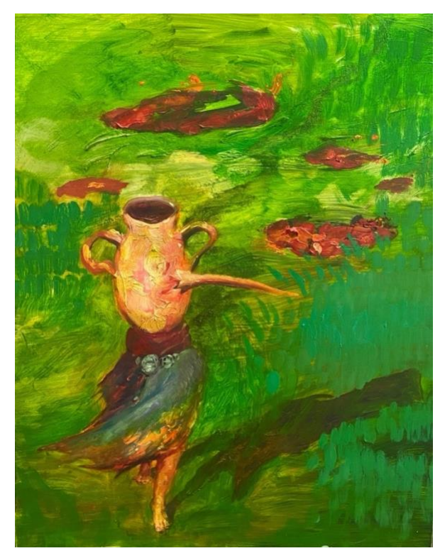
Figure 9. It was Alabaster's portrait all along.

Self-knowledge through critical reflection is an antidote to narcissism.