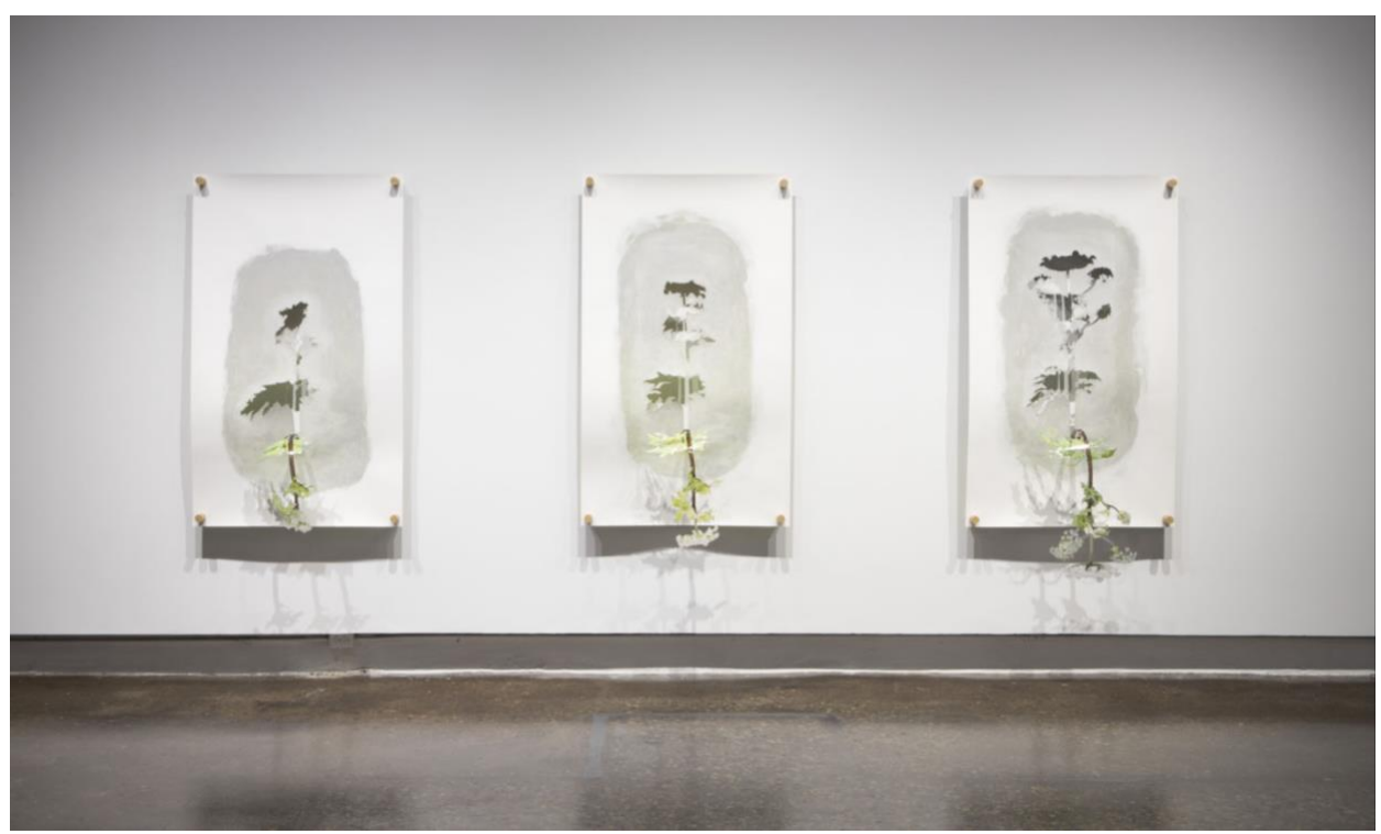
Figure 13. a month of stolen light (2022).

J: The most frightening dream I've ever had took place in the backyard of a newly constructed home, still covered in Tyvek, the yard was red clay and grey rocks. I approached a group of women standing in a circle and speaking reverently of a man. They each spoke in turn of how well he treated them, how they enjoyed his company, how important he was. But one woman stood out from the group because she was bent over and weeping into her hands. When her turn came, the women looked to her and invited her praise. She agreed, she loved him so much, he was so good, but what troubled her was that every time she thought of him and every time she dreamed of him, he appeared in her mind upside-down and backwards.