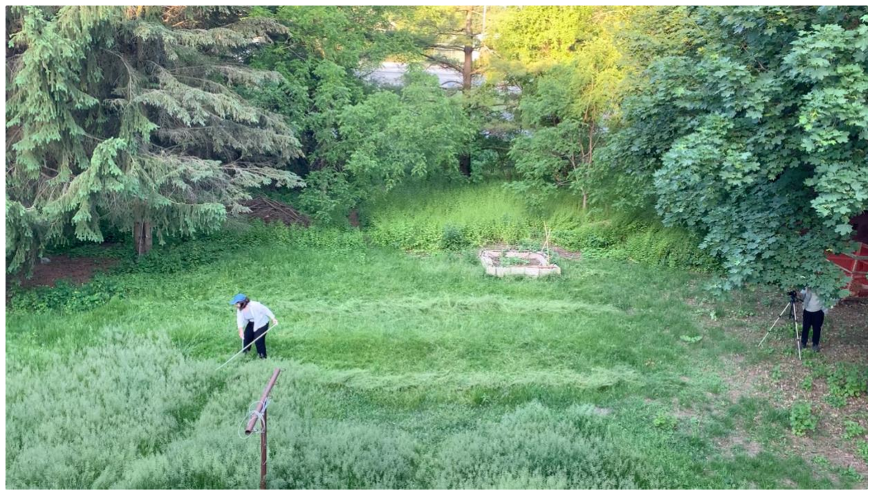
Figure 10. Harvesting our backyard as the sun was rising in July, 2021.

We bought a scythe and woke up early one July morning to bring in the harvest: we gathered the fodder in a haystack, made bouquets, and hung them to dry. We did it with a true love of donkeys in mind: silage, damp and fermented hay, causes donkeys fatal ulcers.