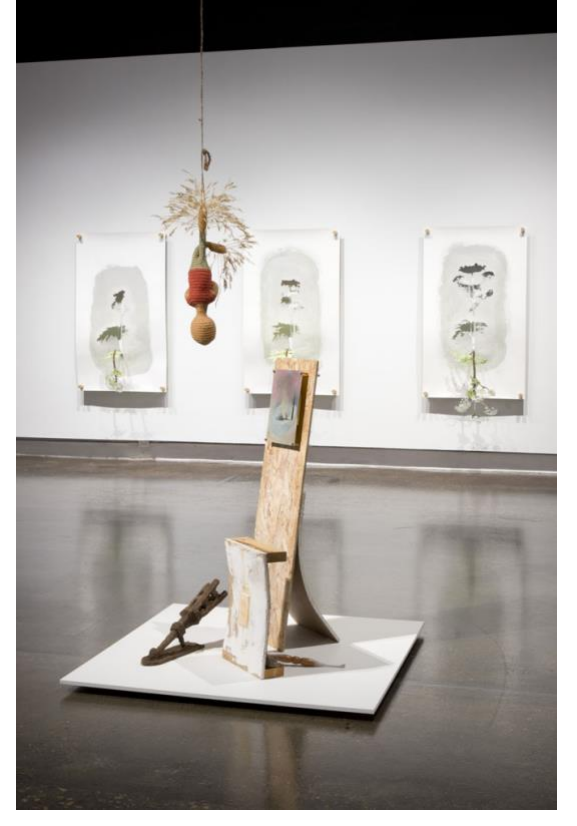
Figure 17. The far small island of take only what you can carry ( 2022 ).