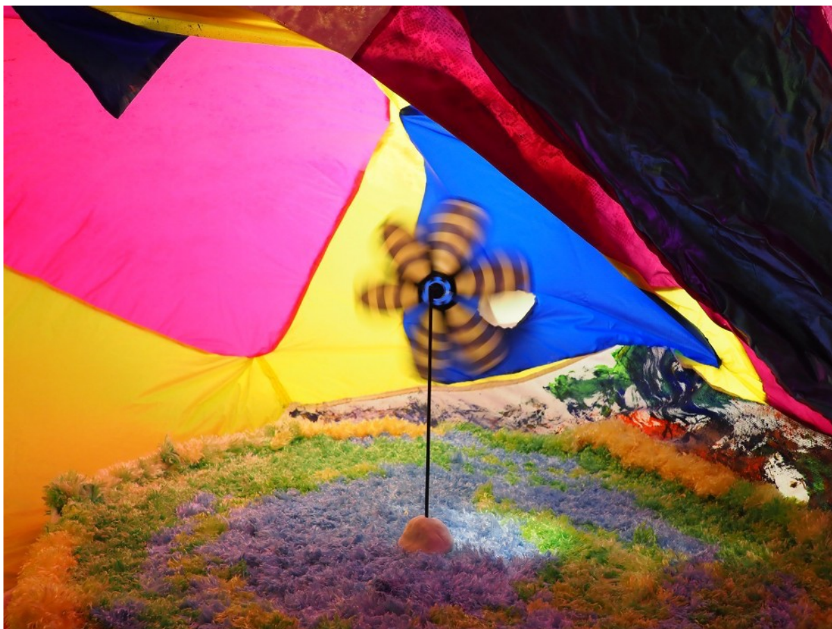
(Figure 4: Grandma's Tattoos inside detail)

The sculpture's exterior is marked by various signs of domestic labour and signifiers from my heritage from both my Scottish Protestant and Italian Catholic immigrant grandmothers – doilies, wallpaper patterns, fabrics from a handmade dress, a tablecloth and a caregiver's uniform. These indicators remind me of the support I felt from my grandmothers, as both had these patterns in their homes. The surface has layers of mark-making in vibrant colours, emphasising the need for alternations, and maintenance to sustain a safe space. On the inside, the colours are also vibrant, intensified by the gallery's directional lighting, the walls blue, orange, purple, yellow, and pink with soft, hand-woven rugs. The interior reflects the qualities of a safe space – intimate, made with care, and with soft cushion-like surfaces – whereas the outside acknowledges and celebrates the labour that went into creating it. If everyone who needed to transform had a metaphorical