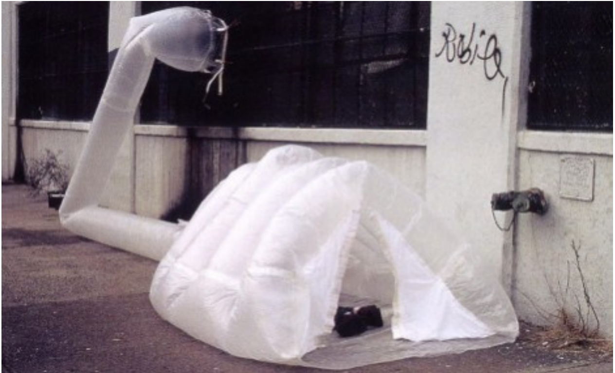
(Figure 5: Micheal Rakowitz, ParaSITE , 1997- ongoing)

is not the (literally) warm and fuzzy of Grandma's Tattoos – it is an artistic yet practical response to the real and present dangers experienced by many people living unhoused in urban settings. Rakowitz's sculpture cum tent addresses the immediate need for harm reduction, whereas the whimsical details of Grandma's Tattoos is a metaphorical stand-in for the care and support vulnerable community members need from those who can provide that care.