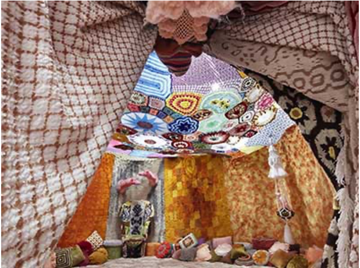
(Figure 2: Allyson Mitchell. Hungry Purse: The Vagina Dentata of Late Capitalism . 2004)

Mitchell's installation draws from items that have enough sentimental value to not be thrown out, but not enough to keep. The overwhelming presence of the female, through handmade labour, sculptural references to genitalia, and item choices, solidifies the Hungry Purse as representing the complex experiences of women in a consumerist world. I see a connection of commentary regarding female experience in a capitalist system between Mitchell's work and my own, although we are each focusing on distinct aspects of the experience. Where we both have a love of second-hand materials and the symbolism they hold, Mitchell utilises the symbolism to speak of sexuality and the lived experience of the female body, where I am using materials that illicit a more clinical