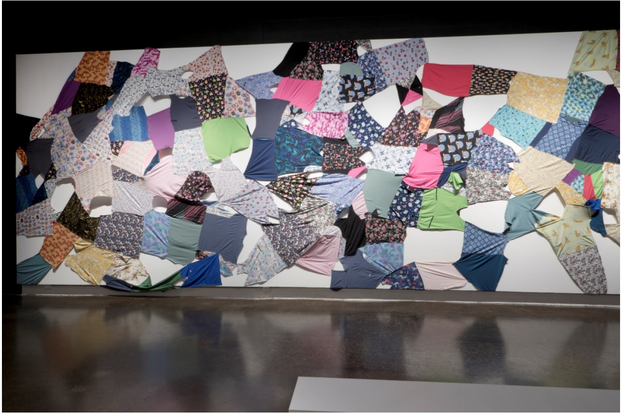
(Figure 1: Scrubs , Christine De Vuono, 2023)

This assumption, that women's labour is natural and free, is in direct conflict with the fight of female-dominated professions for fair wages and work-life balance. Concerning nursing, it is worrisome that the uniforms I find are in remarkably good condition, and that there are so many to choose from which to use. When I trained to be a nurse, I obtained a university degree instead of a college diploma because it gave me the skills to critically reflect and act on the complexity of factors that would affect the people for whom I cared. I wanted to work with a holistic understanding of what constituted good care, understanding how personal history, poverty, diet, social interconnectedness, and privilege affected health outcomes. That was twenty years ago, and today I read stories from burnt out nurses who are so busy triaging patients and filling gaps, that there is no time for this next level of care work (Ontario Nurses Association (ONA), 2022).