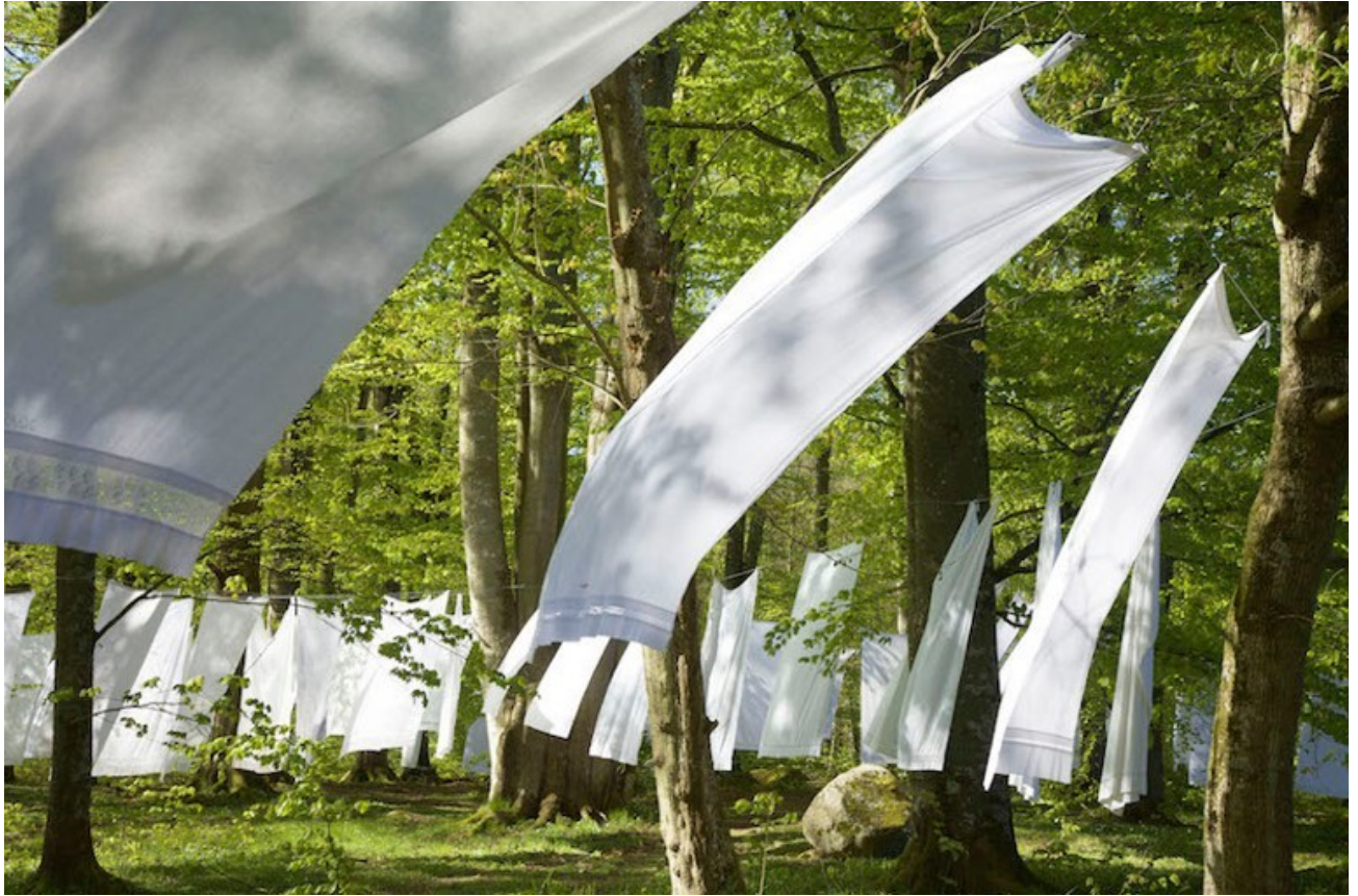
(Figure 12: Kimsooja, A Laundry Field , 2020)

Both installations call upon culturally influenced notions of domestic labour, home, and interconnectedness, yet the feel of each is unique and diametrically opposed. In Kimsooja, A Laundry Woman – Korean signifiers in form, colours and usage in a German museum – have the bedcovers in a gallery setting with white walls, above viewers' heads, out of reach, richly saturated in colours that are mirrored in the bottari on the floor, yet A Laundry Field uses Swedish traditional bedsheet designs that hang throughout a Swedish forest. Kimsooja intermixes the mundane with global diversity to inform her work, having commonplace intermingle with diversity of culture as she experiences it through her life and practice. "I saw art in life and life as art. I couldn't separate one from another. So my gaze to the world and my questions were always related to life itself" (Kimsooja, quoted by Rappolt).