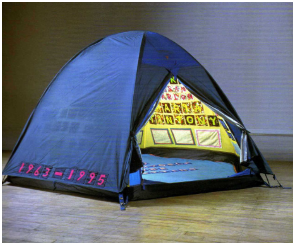
(Figure 6: Tracey Emin, Everyone I have Ever Slept With, 1963-1995 , 1995)