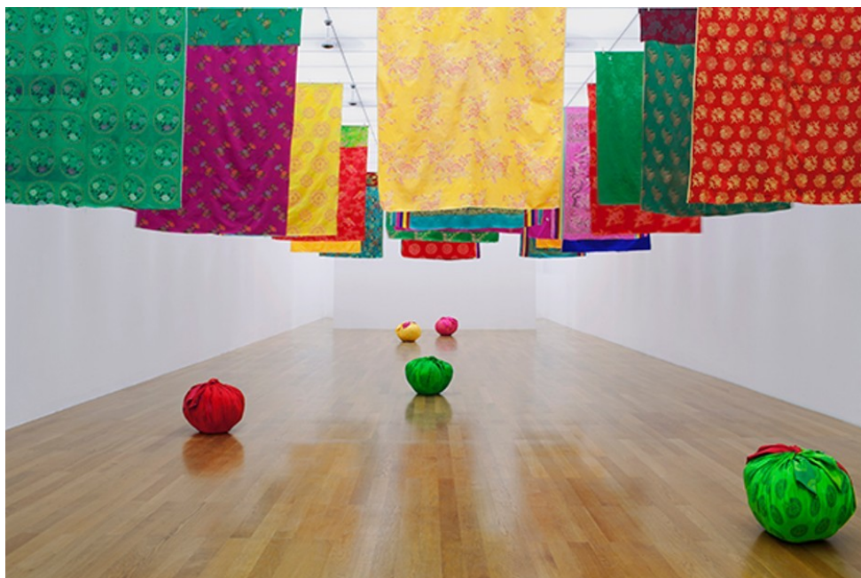
(Figure 11: KIMSOOJA, A Laundry Woman , 2000)