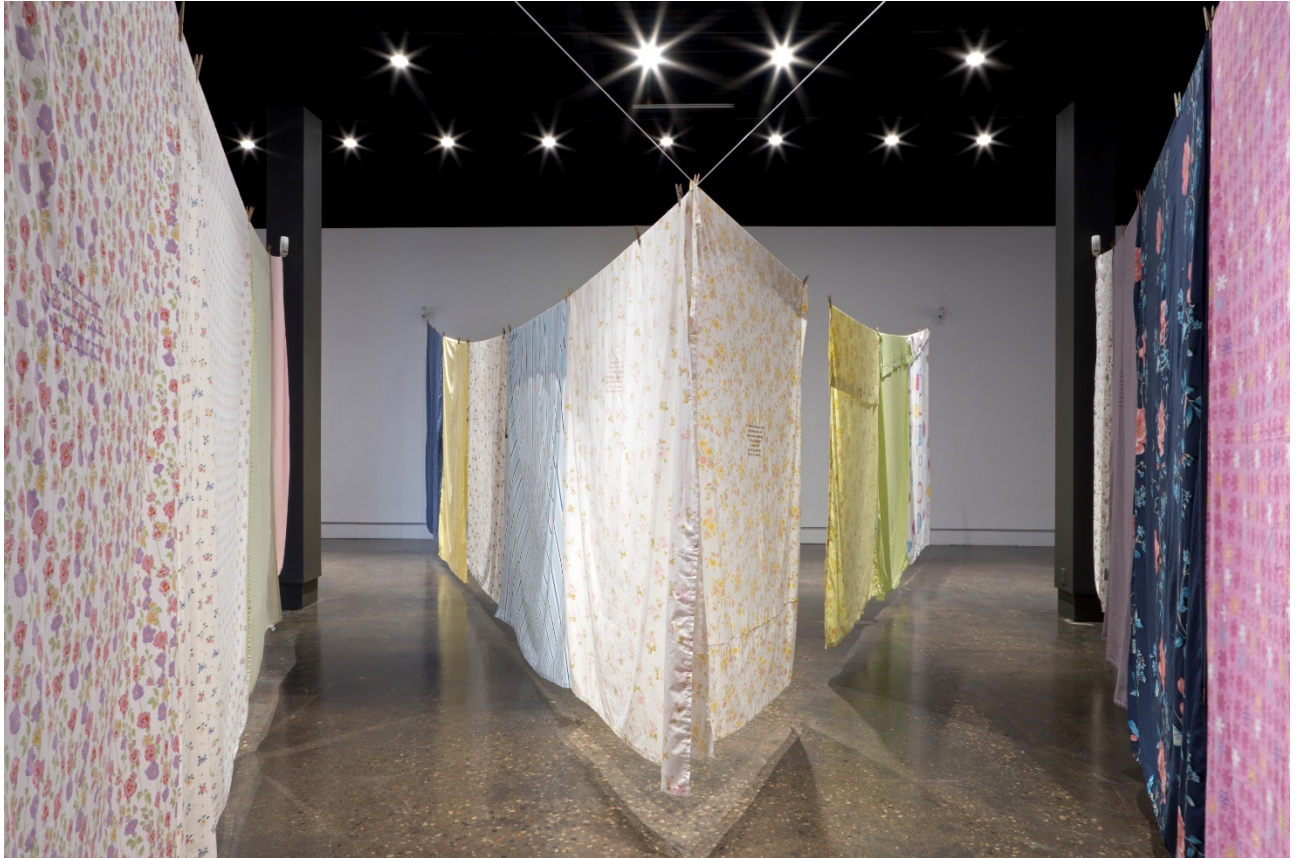
(Figure 8: You're Invited , 2023. Installation)

than physical care – the emotional labour that makes people feel seen and nurtured. 4 I chose second-hand sheets as a ubiquitous item that is a source of comfort, solace, and warmth: an object present during birth, death, and sex, that I then elevated into an art installation.