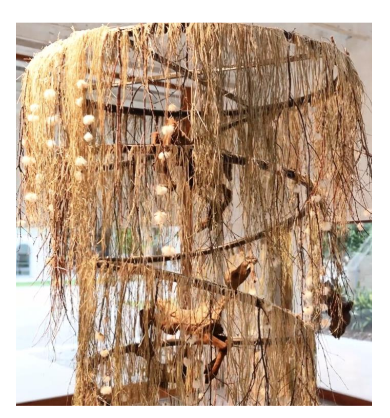
Fig 17. Máret Ánne Sara, 'Ale suova sielu sáiget', 2022.