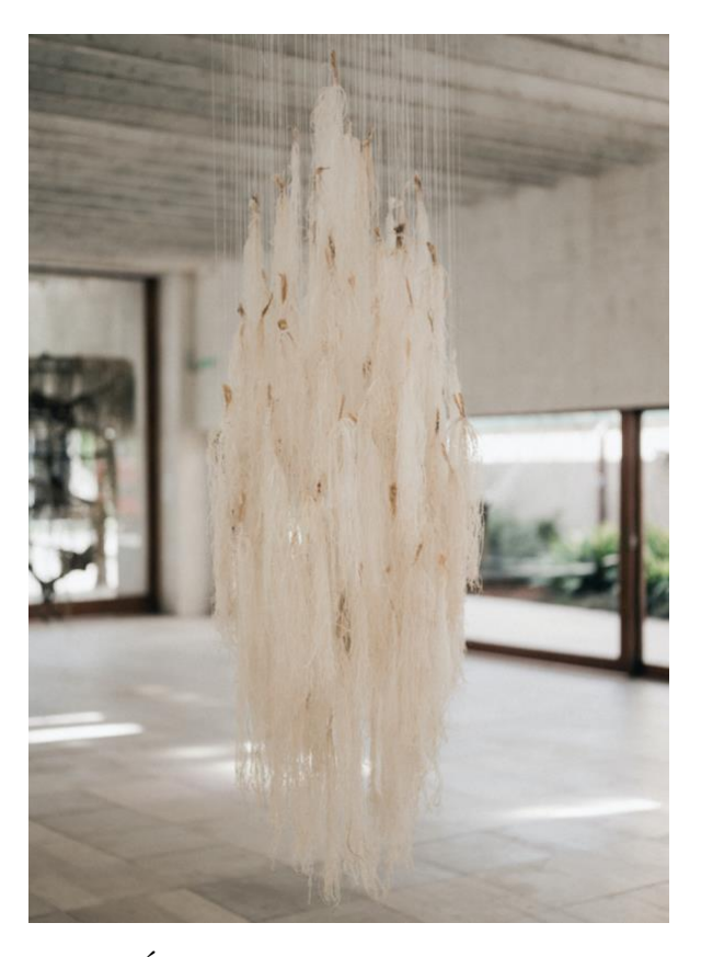
Fig 20. Máret Ánne Sara, 'Du-ššan-ahttanu-ššan', 2022.

instinct (Fig. 19).<sup>50</sup> The Reindeer's stomach embodies the lived experiences of violence towards the Sámi and Reindeer inflicted by the Norwegian state, "the dispossessor of futures" to the Sámi and Reindeer.<sup>51</sup>