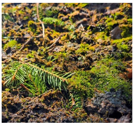
Fig 4. Stephanie Florence, Detail of Quarters or Cradles? And displaced centers , 2023.