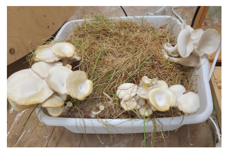
Fig 10. Stephanie Florence, Fleshy Oyster Mushrooms growing in the studio nursery, 2022.