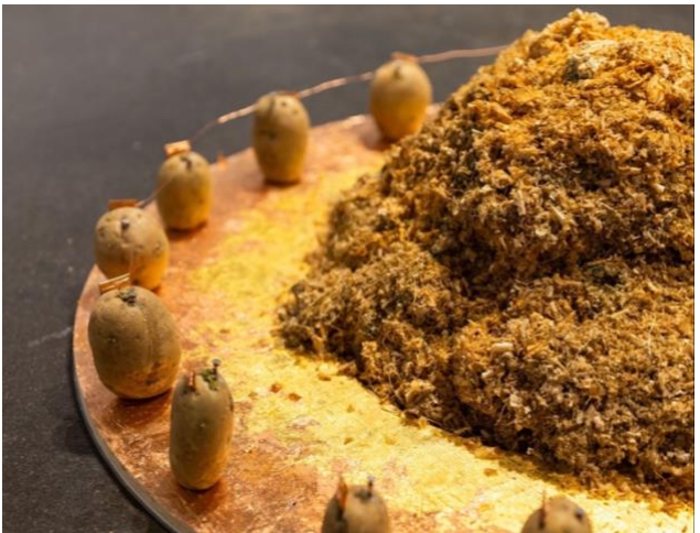
Fig 4. Scott Lee, rinse and repeat , view of exhibition including the apparatus , 2023.