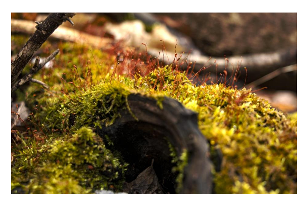
Fig 1: Moss and Liverwort in the Region of Waterloo.

In dedication to my family members who could not see a way through the chaotic trauma of life and sought the earth in solace.