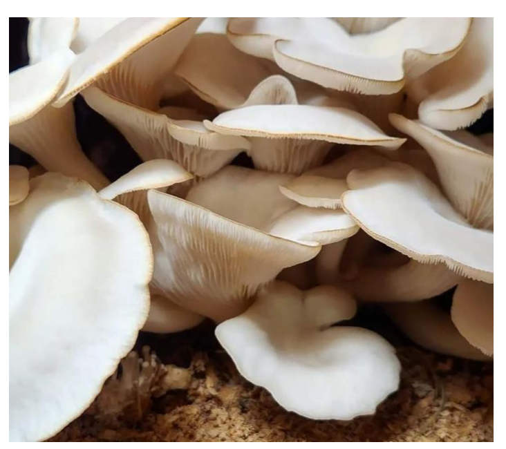
Fig 12. Stephanie Florence, Healthy Blue Oyster Mushrooms growing in the studio nursery 2022.

A normal day in the studio might start with setting up bowls and tubs for Moss Spa, boiling sawdust in a two-foot homemade "tea bag," or filtering watering water to go into a humidifier (Fig. 13). On another day, I might be using a grinder to make sculptures out of the limbs and stumps I have collected, which are eventually given back to the Land to be reclaimed by nature. On other days I am building circular mobile habitats for the Moss and Fungi, which are evolving into half circle and quarter cradles. However, these actions are based in a circular practice that is grounded in relational thought that place value on consent, care, respect, honour, and giving back to the collective.