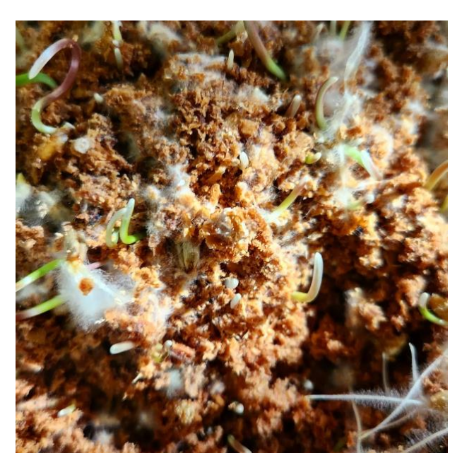
Fig 11. Stephanie Florence, Mycelial and Wheatgrass roots growing in sawdust, 2022.

Step five: Cover the wood chip and spawn with a cover or plastic bag OR leave the wood logs somewhere dark and damp allow 4 to 8 months depending on width of wood. (Fig. 12)