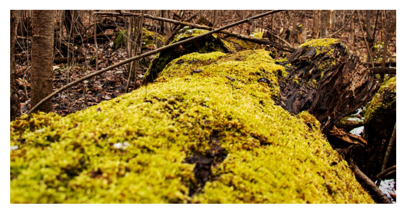
Fig 6. Moss on fallen Tree in the Region of Waterloo. Picture taken during a walk and listening.

As listeners walk through the Landscape, they will encounter physical artworks integrated into the Land, some more obviously placed than others as interventions and intrusions. One of these is offering , which went through a transformational process. When I began, it was originally named Extracting Dis-place and involved sculpting wooden limbs of trees into amorphous Animal limbs (Fig. 7). I initially hung the wooden limbs – of Extracting Dis-place – with steel cable in a studio in the Fine Arts department in East Campus Hall. However, this lacked the connection to the Landscape that was needed for a clear understanding of the power imbalances that affect the Land, the Water, the Kinfolk, the Plant-beings, the Animal-beings, the Invertebrate-beings, and Bacterial-beings. The transformed artwork, offering , has a clear reflection of giving back to the Land and relational beings in the area which the first iteration lacked.