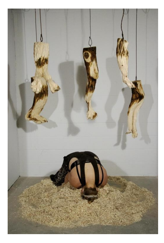
Fig 7. Extracting Dis-place, the first iteration of offering.

I also did an action of care with the Maple Trees' sawdust produced in the sculpting of the limbs. I wore a mask and goggles to protect my eyes and lungs while repetitively hugging and embracing the sawdust. Upon reflection, I found this action to be problematic as it was still embroiled in the asymmetric relationship of my power over another being; an action that was about the care given following the violence of a being that was cut down and the violence of sculpting the wood with a grinder. Achille Mbembe shows how, "the world is no longer considered an artifact that humans make," and the "indifference to objective signs of cruelty" signal the disposability of life and meaninglessness of death. <sup>29</sup> When colonial violence occurs in