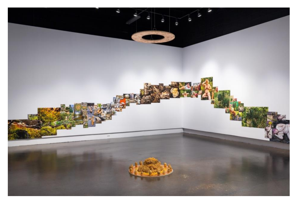
Fig 2. Scott Lee, rinse and repeat , view of exhibition including the apparatus and personnel growth , 2023.

With the proper care, mycelium can flourish indoors, although they will eventually need to grow larger and connect to different ecosystems. Furthermore, the gallery becomes a connecting hub between the (h)uman world and the relational ecosystem that is introduced through the listenings and walking tours. The role of the gallery is altered from a location that exists to exhibit into a collaborative-dialogical space that embraces community discussion and participation with all beings and matter.