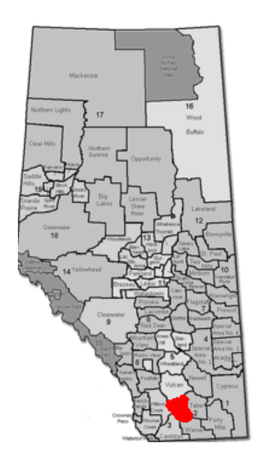
Figure 2. Map depicting the location of the County of Lethbridge within Alberta.

the major crop of the region; it is processed locally and is exported around the world. Other grains include barley, canola, flax, rye, and oats. Organic production in the area is lower than other parts of the province and country, and mostly focuses on livestock and field crops, with limited organic dairy and vegetable production (Snider, personal communication, April 13, 2007).