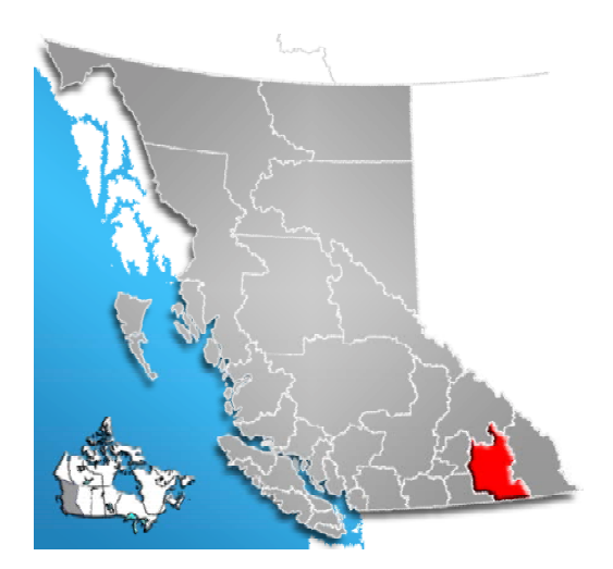
Figure 3. Map depicting the location of the Regional District of the Central Kootenays within British Columbia.

Creston is the centre of agricultural endeavor in the Central Kootenay Regional District. This area produces grains as the main cash crops, but also potatoes, field peas and beans, forage seeds and hay are also cultivated (Province of British Columbia, 2001). The Creston area also has a significant amount of tree fruits, particularly apples, and berry crops<sup>24</sup>. There is also a dairy industry here but due to limited local processing it has been on the decline in recent years. Beef cattle, hogs, and poultry are also present in this area.