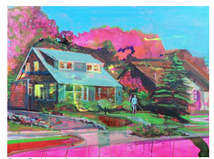
Dean Residence, fig. 2 Oil, Acrylic & Coloured Pencil on Canvas 36" x 48" 2008

interactions. As I reflect on this earlier work, I notice that I continue to use outlines or silhouettes as a compositional device in my work. As exemplified in the later painting, Dean Residence (fig. 2), my earlier ideas evolved into overlapping architectural forms