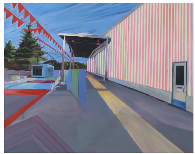
Modular Units, fig. 9 Oil, Acrylic & Coloured Pencil on Canvas 48" x 60" 2007