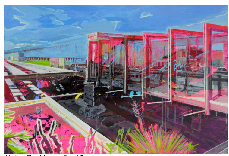
Upton Residence, fig. 10 Oil, acrylic & Coloured Pencil on Canvas 40" x 60" 2008

reach the horizon line they must work their way through the elongated and exaggerated composition. Along the way, viewers encounter skewed shapes, overlapping abstracted forms and patterns. The space depicted behind the