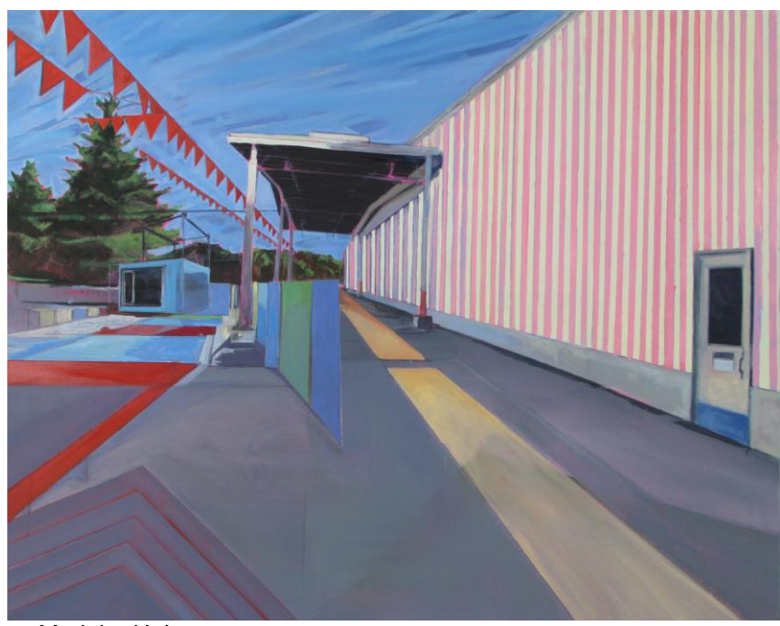
Modular Units Oil, Acrylic & Coloured Pencil on Canvas 48" x 60" 2007