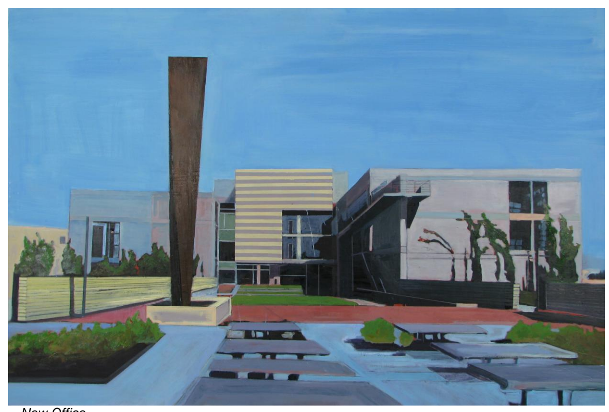
New Office Oil & Coloured Pencil on Board 48" x 72" 2007