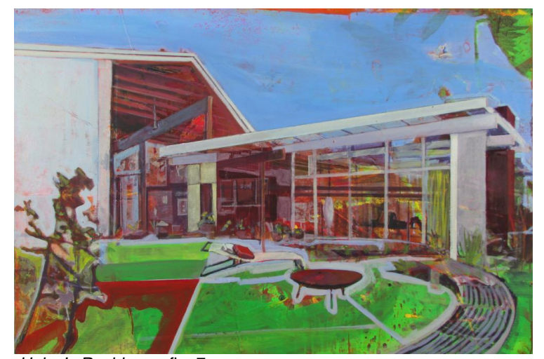
Haine's Residence, fig. 7 Oil, Acrylic & Coloured Pencil on Canvas 36" x 40" 2008

I eliminate all lighting sources, adding an element of ambiguity to my colour selection. As demonstrated in the painting, Haine's Residence (fig. 7), I often overlap projections enabling me to fragment