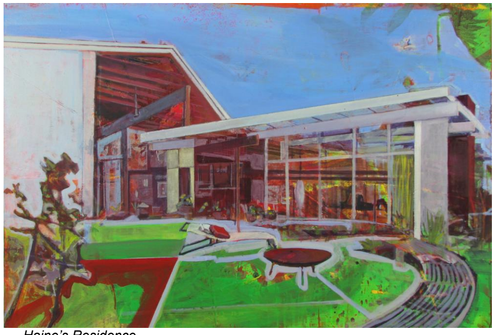
Haine's Residence Oil, Acrylic & Coloured Pencil on Canvas 32" x 48" 2008