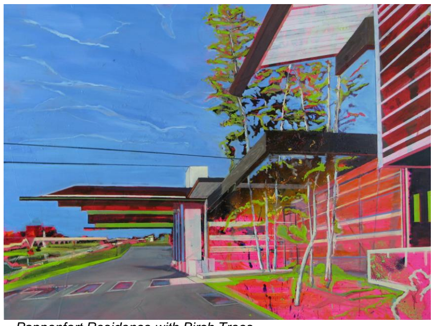
Pappenfort Residence with Birch Trees Oil, Acrylic & Coloured Pencil on Canvas 36" x 48" 2008