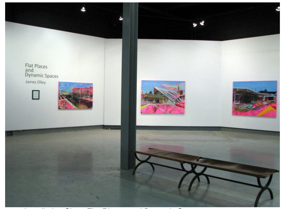
Installation Shot, Flat Places and Dynamic Spaces 2008