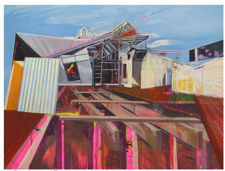
Bending and Tension Oil, Acrylic & Coloured Pencil on Canvas 54" x 72" 2008