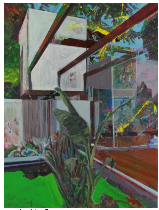
Inside Out Oil, Acrylic & Coloured Pencil on Canvas 48" x 36" 2008