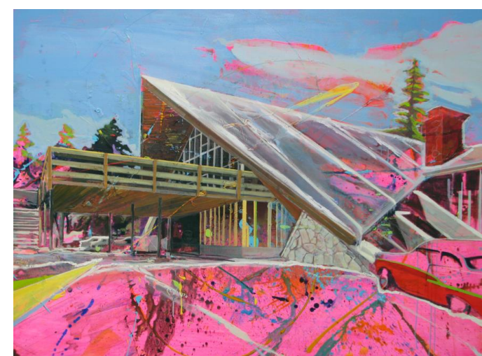
Mammoth Mountain Inn, fig. 5 Oil, Acrylic & Coloured Pencil on Canvas 54" x 72" 2008

create an association with the viewer even though they are only seeing part of a whole or seeing these fragments in a constructed setting. As demonstrated in the work, Mammoth Mountain Inn (fig. 5), only the outline of the shape of the car is visible in the bottom