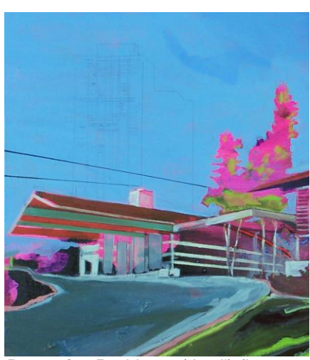
Pappenfort Residence (detail), fig. 6 Oil, Acrylic & Coloured Pencil on Canvas

right of the painting. The viewer is able to complete the fragmented form as a car and identify it. Another example of fragmentation used in my work is in, Pappenfort Residence . As seen in the detail (fig. 6), I outline part of an apartment building in the background, which is sufficient for the viewer to assume the association of this shape as a building. I wish to