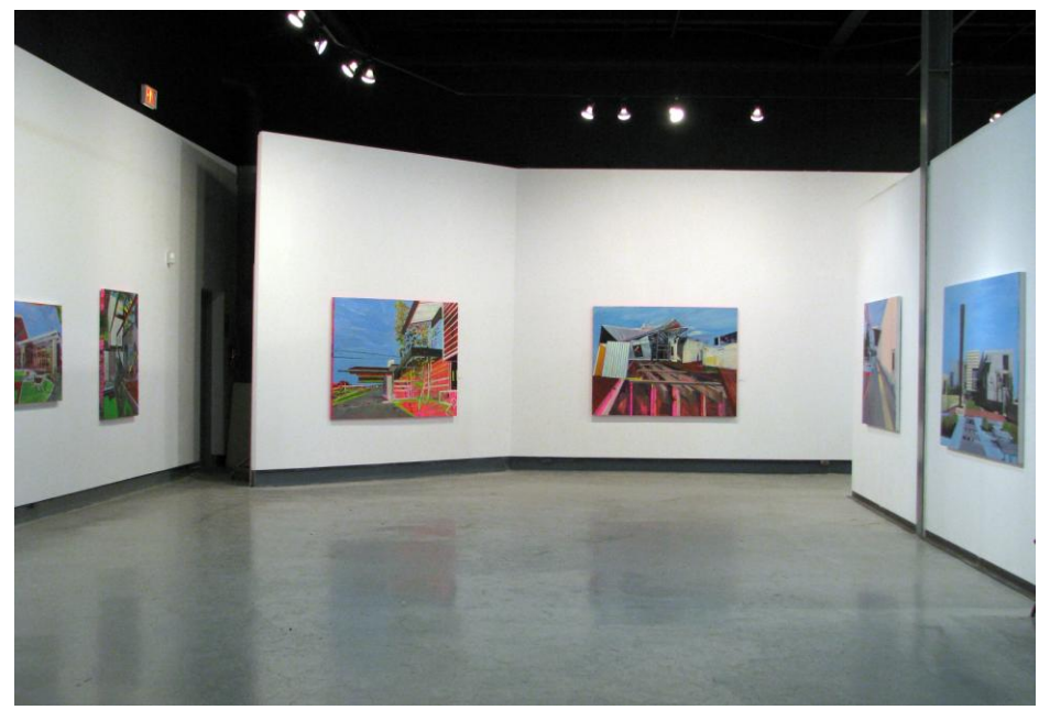
Installation Shot, Flat Places and Dynamic Spaces 2008