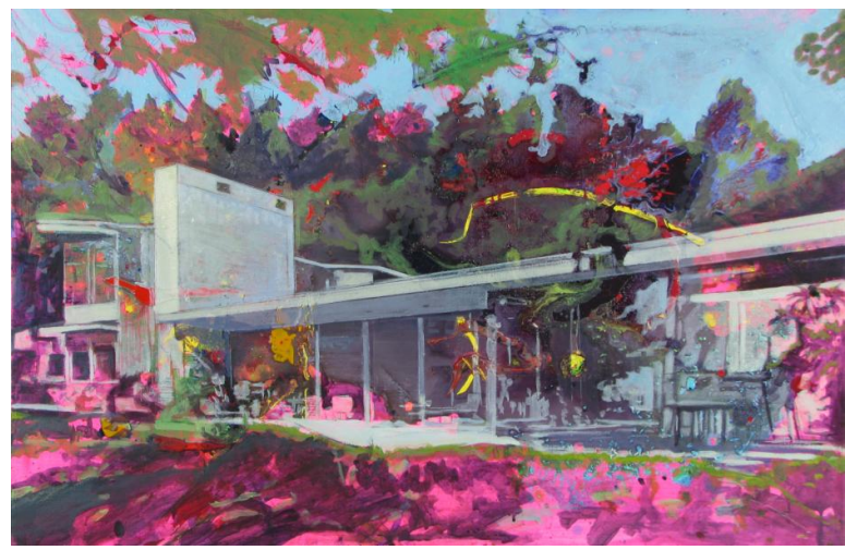
Robbins' Residence, fig. 8 Oil, Acrylic & Coloured Pencil on Canvas 24" x 36" 2008

behind the architectural form as a way to explore an interaction between emerging and dissolving forms that are concurrently in both a representational and abstracted state.