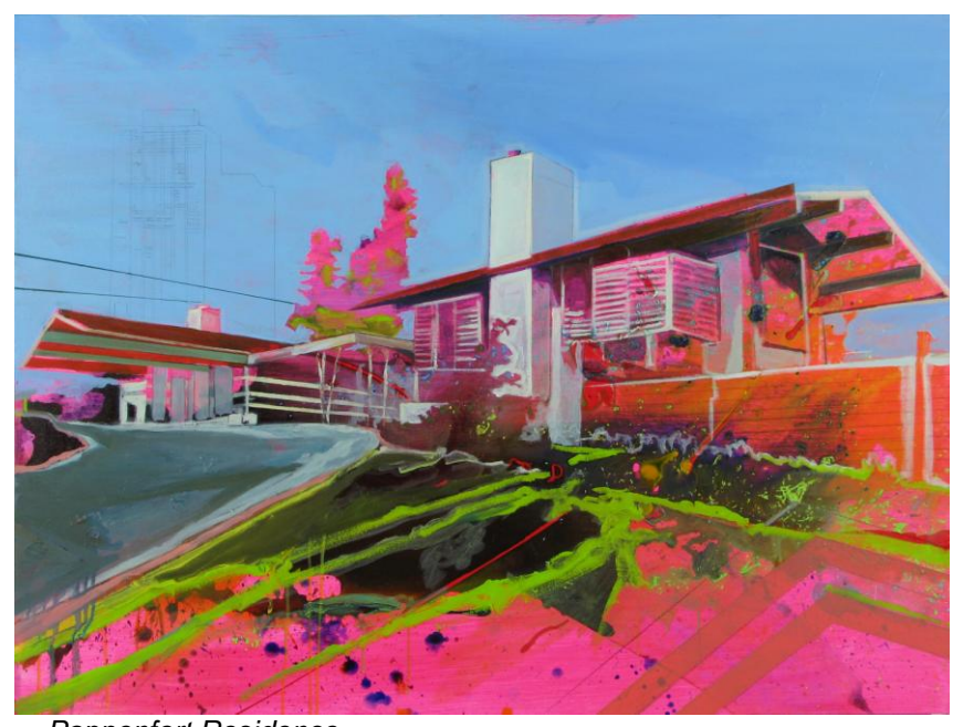
Pappenfort Residence Oil, Acrylic & Coloured Pencil on Canvas 36" x 48" 2008