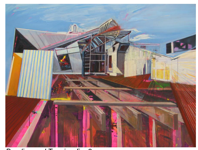
Bending and Tension, fig. 3 Oil, Acrylic & Coloured Pencil on Canvas 54" x 72" 2008

spaces that reflect synthetic environments. In my work, Bending and Tension (fig. 3), I use overlapping shapes and architectural forms to develop a space that references a suburban or commercial dwelling. The space looks artificial and lacks a reference to the natural world,