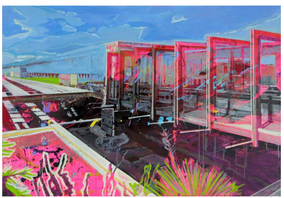
Upton Residence Oil, Acrylic & Coloured Pencil on Canvas 40" x 60" 2008