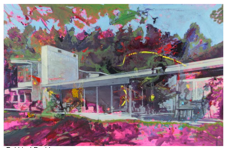
Robbins' Residence Oil, Acrylic & Coloured Pencil on Canvas 24" x 36" 2008