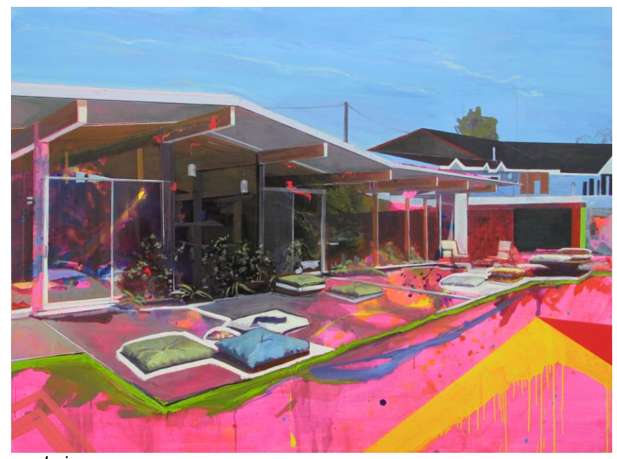
Leisurescape Oil, Acrylic & Coloured Pencil on Canvas 54" x 72" 2008