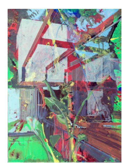
Inside Out, fig. 4 Oil, Acrylic & Coloured Pencil on Canvas 24" x 18" 2008

architectural structures on top of the painting,