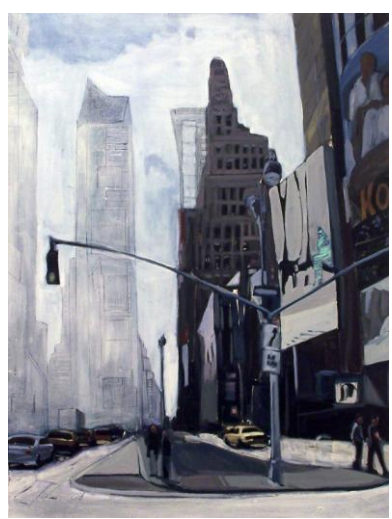
The Conversationalist, fig. 1 Oil on Canvas 48" x 36" 2006

In many of my earlier works, such as The Conversationalist (fig. 1), I explored Soja's concepts about tensions and energies within the urban environment. A tension is created between the visible buildings in the foreground and the dissolving buildings in the distance, which can be seen as