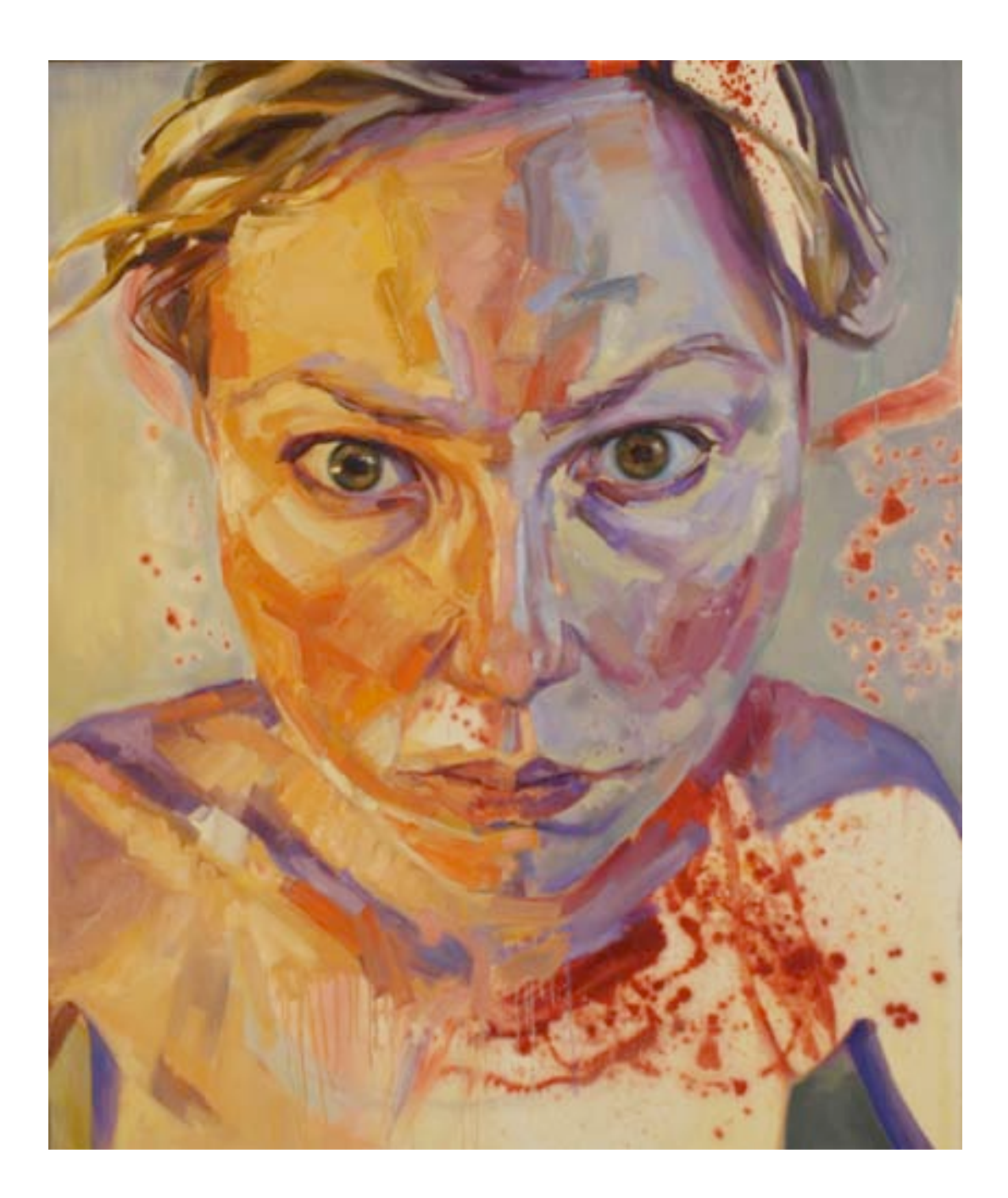
Figure 5. Miranda Urbanski, Staring Contest, Oil on canvas, 5 x 6 feet, 2009