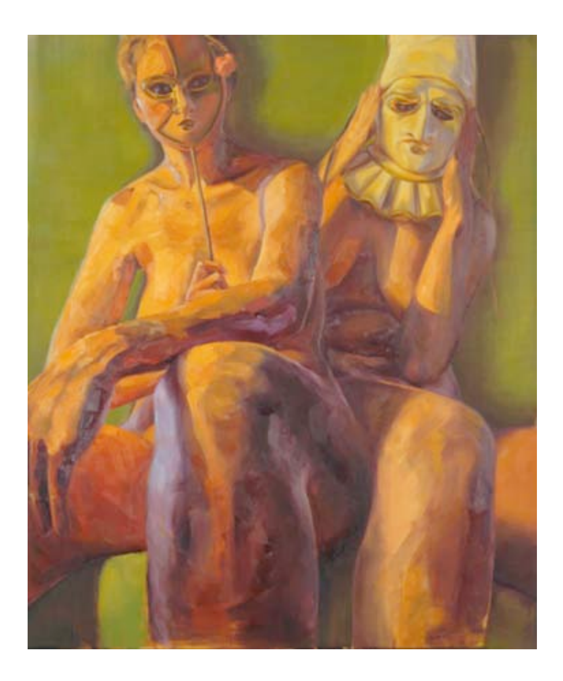
Figure 1. Miranda Urbanski. Double Entendre, Oil on canvas, 5 x 6 feet, 2008