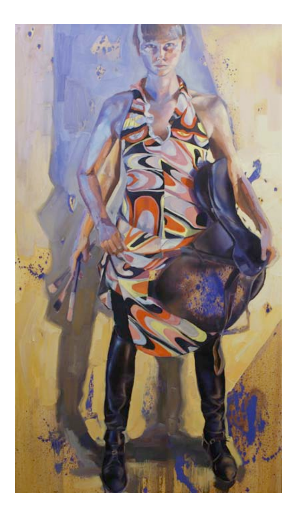
Figure 6. Miranda Urbanski. Expensive Habit, Oil on canvas, 4 x 7 feet, 2009