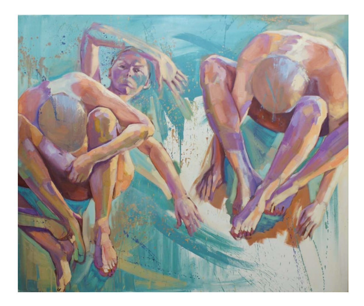
Figure 3. Miranda Urbanski, The Hybrids, oil on canvas, 5 x 6 feet, 2009