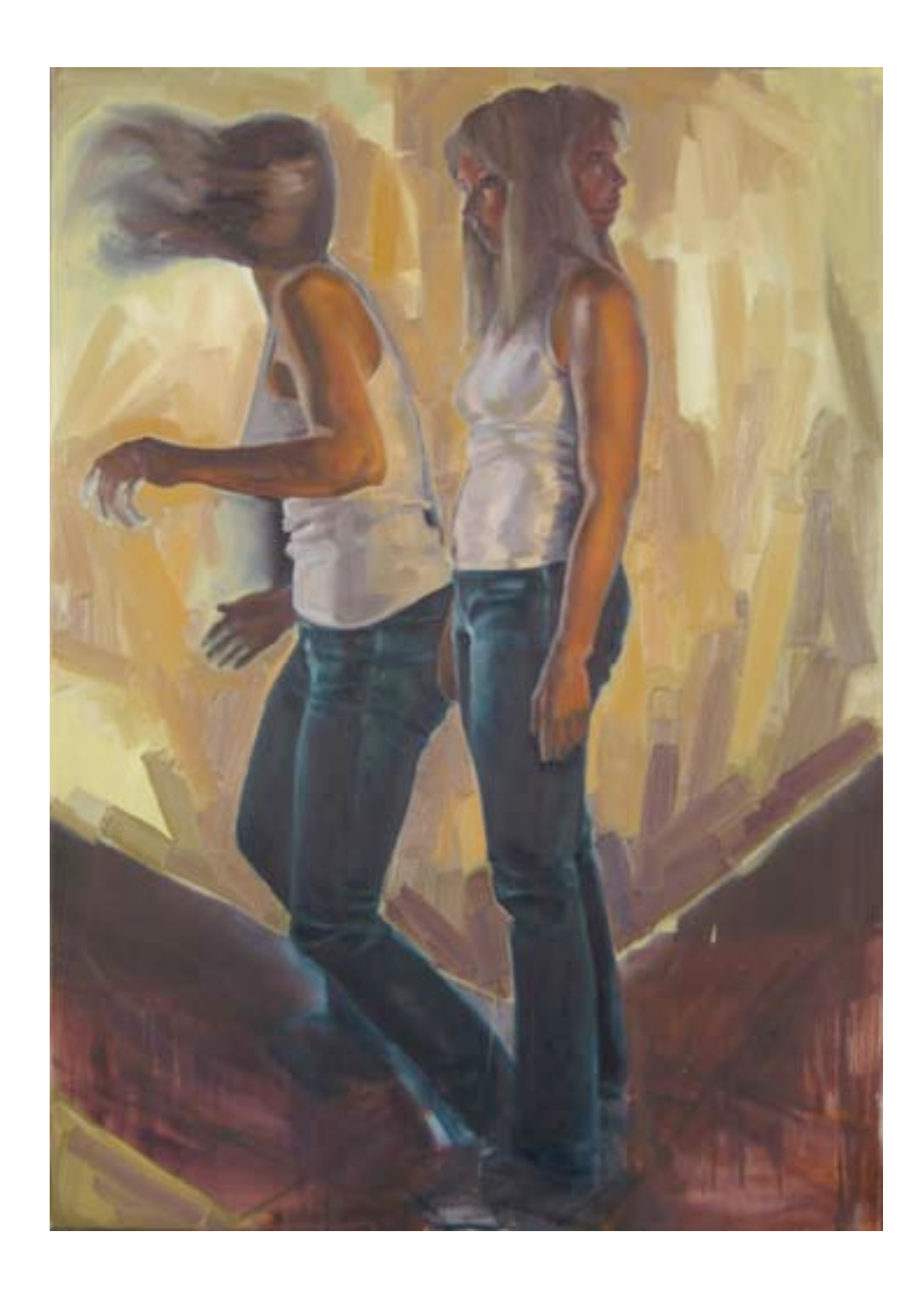
Figure 2. Miranda Urbanski, Crossroads, Oil on canvas, 5 x 7 feet, 2008