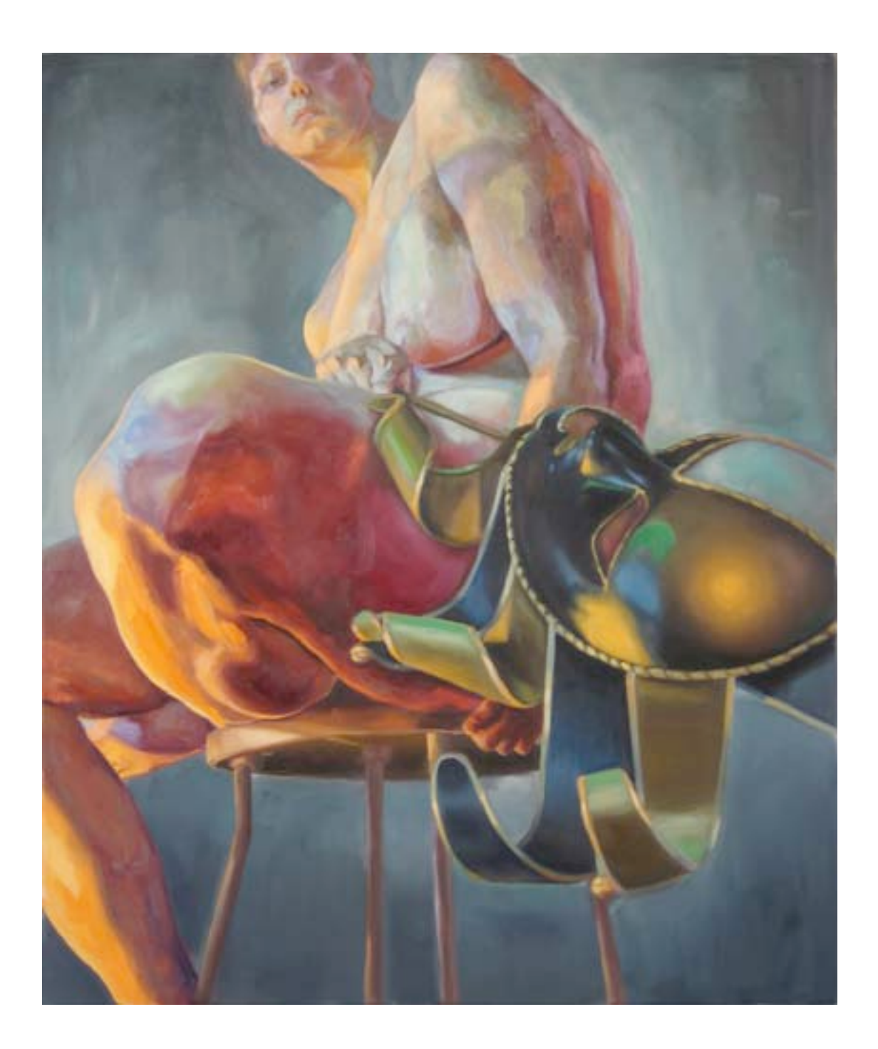
Figure 7. Miranda Urbanski. All the world's a stage, oil on canvas, 5 x 6 feet, 2008