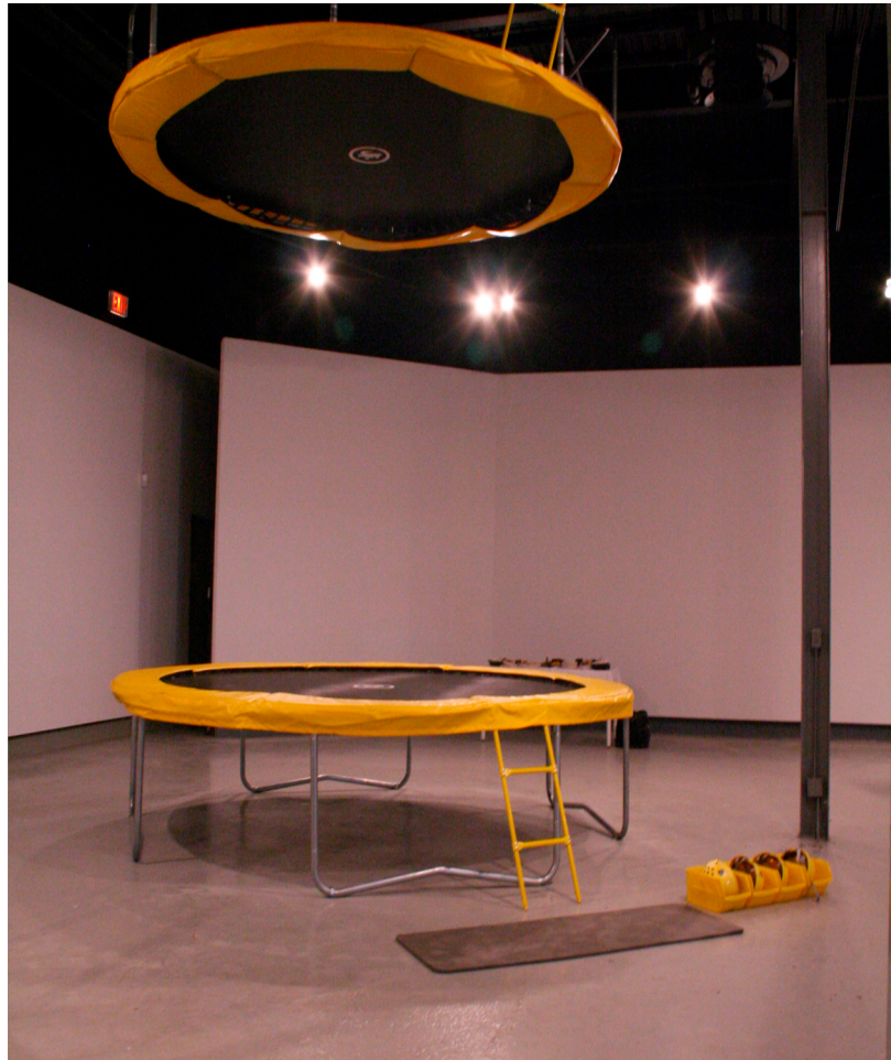
5 Maturity Reach , 2008. Trampolines, ladder, mat, helmets.