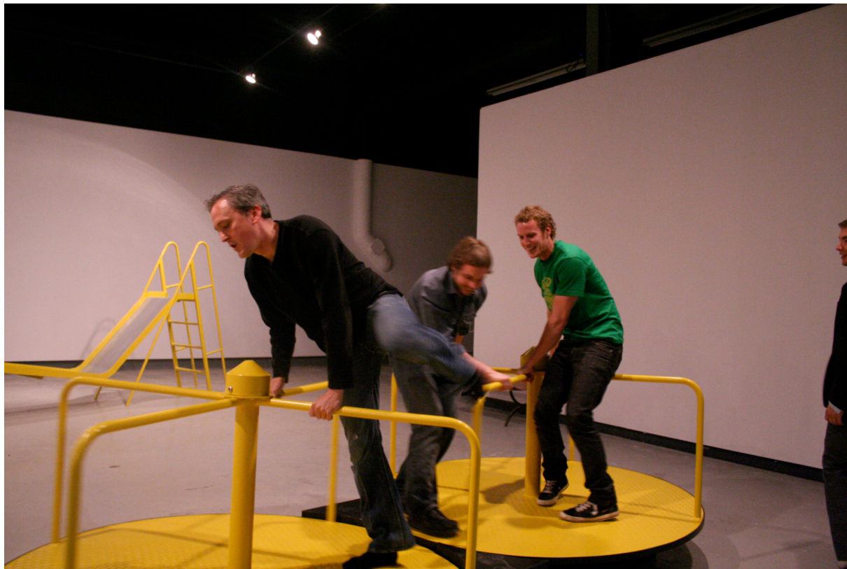
8 Maturity Spin . Interaction.