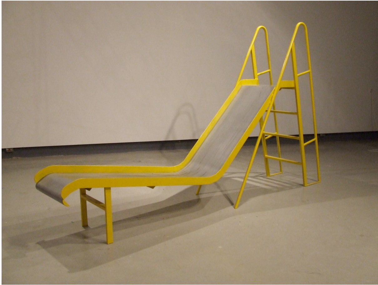
1 Maturity Bend , 2007. Metal.