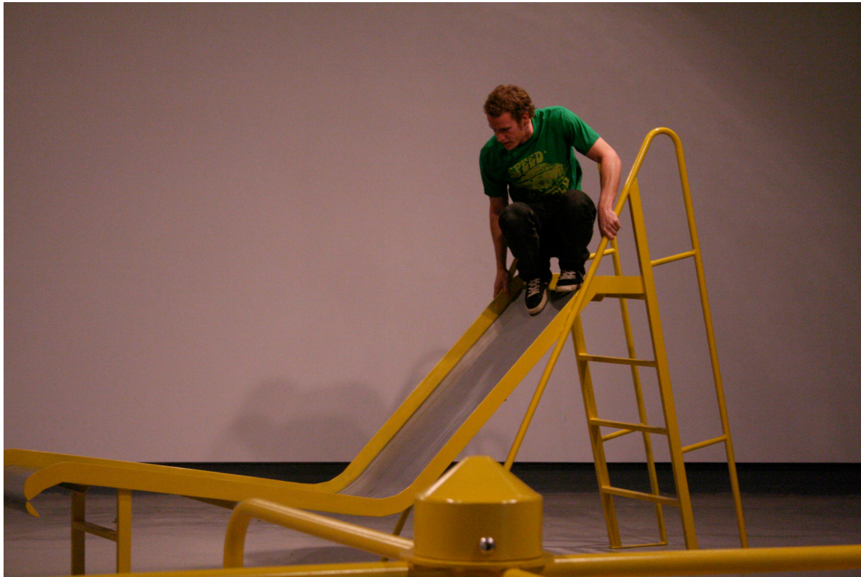
2 Maturity Bend. Interaction.