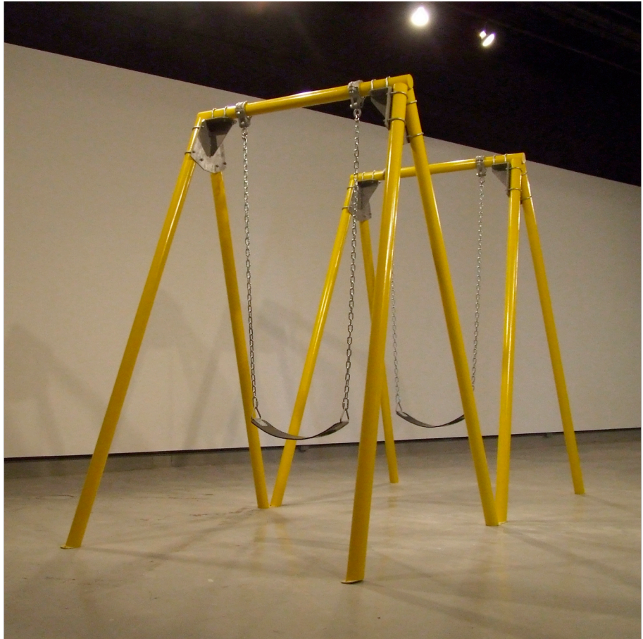
3 Maturity Correlation , 2008. Swing seats, chains, clasps, metal.