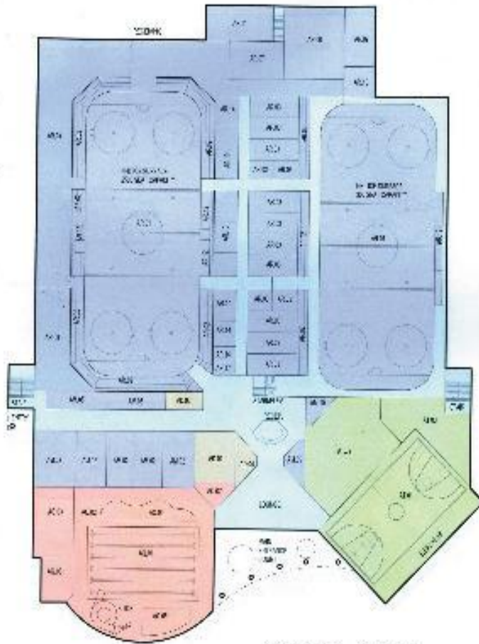
GROUND FLOOR CONCEPT PLANS