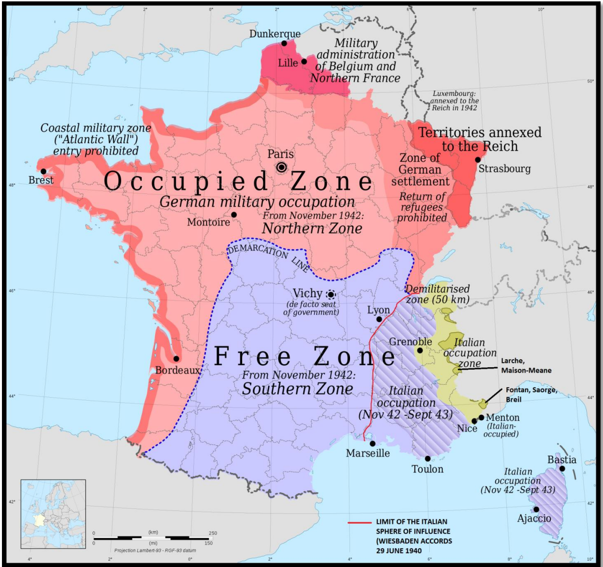
Map 1 Occupied France, 1940-1943