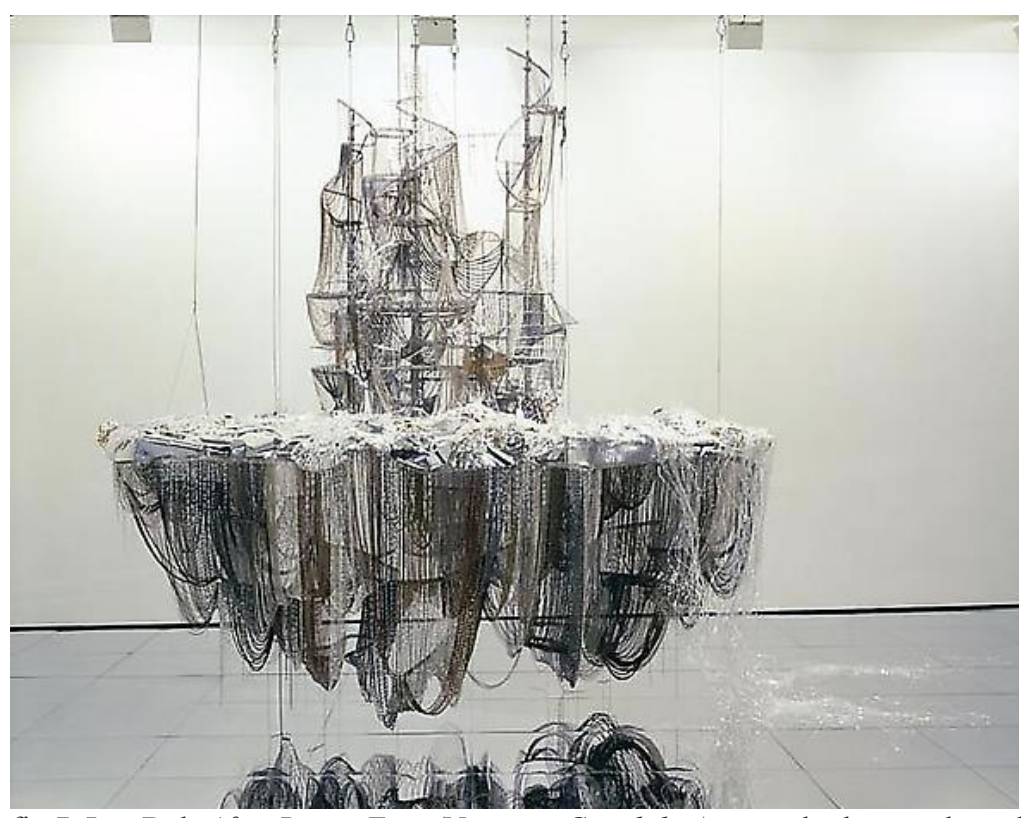
fig.7 Lee Bul, After Bruno Taut (Negative Capability) , crystal, glass, and acrylic beads on stainless steel armature with aluminum and copper mesh, with chains made of PVC, steel, and aluminum, 108" x 116" x 84", 2008

as After Bruno Taut (Negative Capability) , 2008. The work is visually striking, however it is not crafted out of fine, luxury materials but out of the items of massproduction. "The beads sourced for the installation are mainly cheap, plastic, ornaments—the kind fabricated in Asia and sold at low prices in Western dollar stores" (Shaughnessy, 35). Through the excessive use of the materials, Bul comments on our flamboyant consumer culture (fig.7).