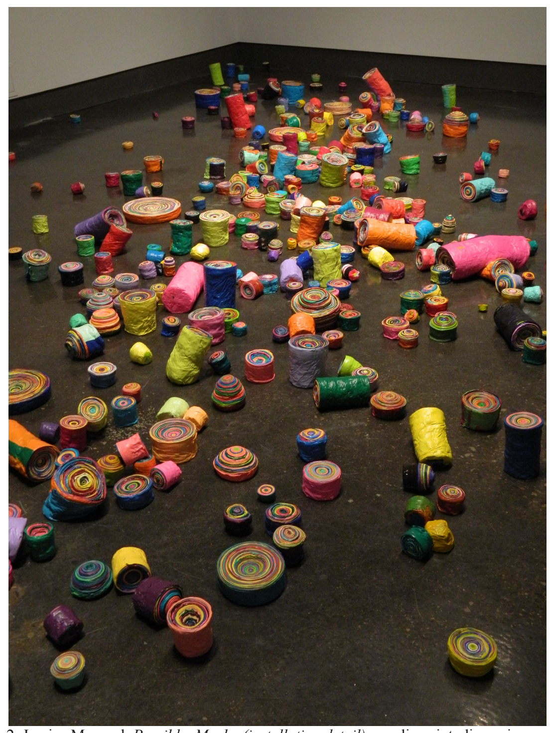
fig.2 Jessica Massard, Possibly, Maybe (installation detail) , acrylic paint, dimensions variable, 2013