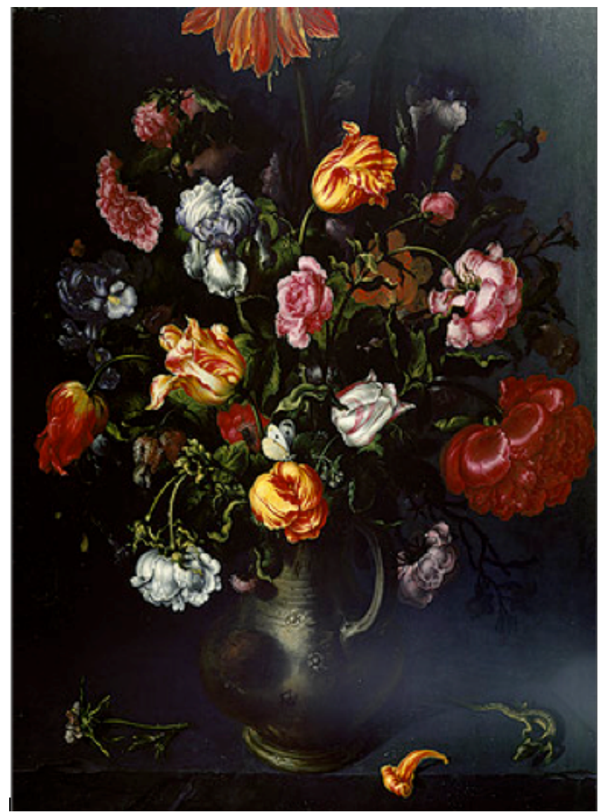
fig.5 Jacob Vosmaer, A Vase with Flowers, Oil on Board, 33.5" x 24 5/8", 1618

shiny consumer culture that may ultimately lead to the collapse of the world as we know it. These themes are mirrored in many aspects of "contemporary visual culture and the rapid succession of creative fashions and trends," it produces and liquidates (Grunenberg, 5).