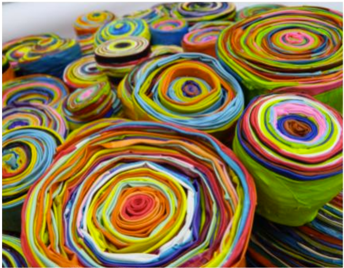
fig.10 Jessica Massard, Possibly, Maybe (detail) , acrylic paint, dimensions variable, 2013

variations of reds, yellows, as well as fluorescents. Given such differences in the chemical structure of paint I have decided to make polychromatic objects as opposed to monochromatic objects in order to accentuate the above-mentioned tensions between varying colours (fig.10).