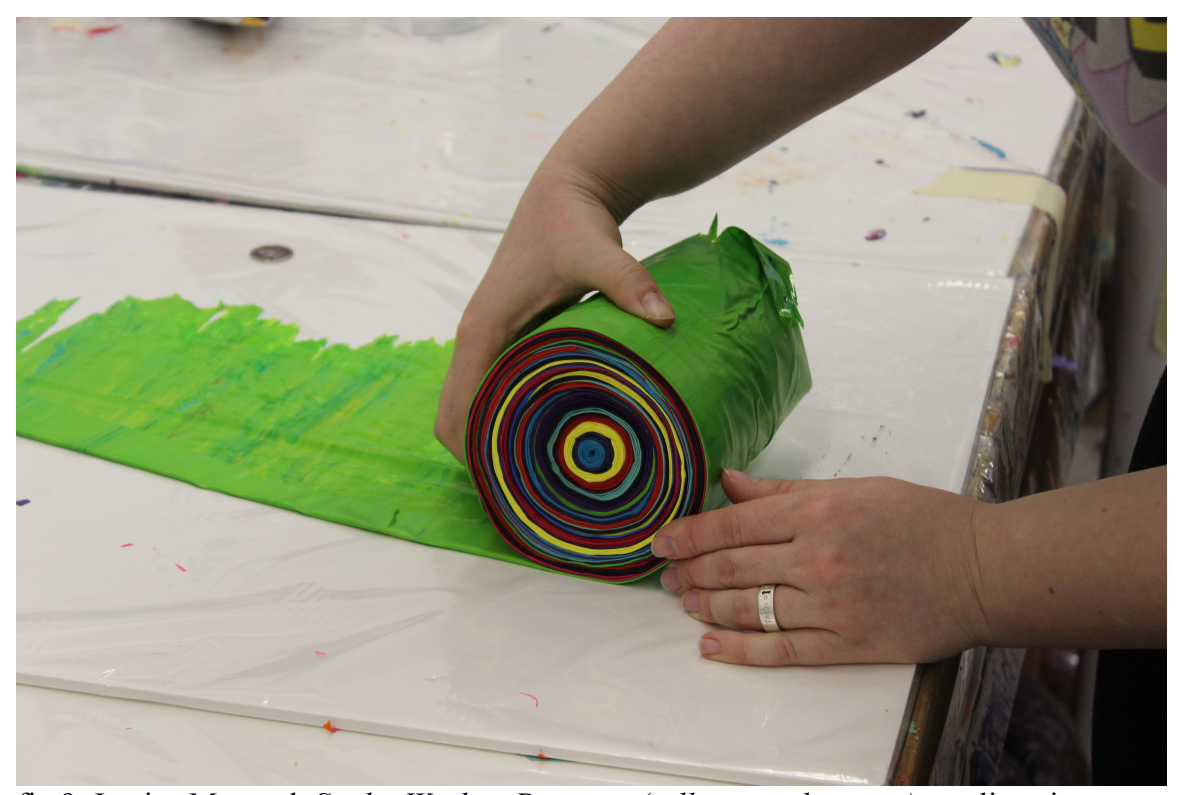
fig.9 Jessica Massard, Studio Work in Progress (rolling acrylic paint) acrylic paint, dimensions variable, 2013

paint permanently fuse to one another and as a result no adhesives are required to bind them. This process is repeated as additional coloured strips of paint are rolled, eventually building the complete object (fig.9).