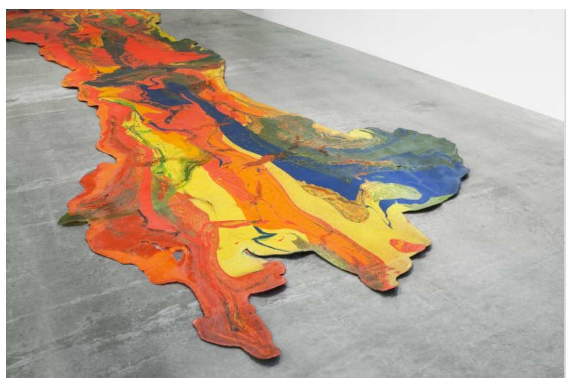
fig.6 Lynda Benglis, Contraband, Pigmented latex, 3" x 116" x 398", 1969

"fallen paintings" (Richmond, 41). Eva Hesse was also creating work, which utilized synthetic materials like polymers. I am interested in Hesse's work because the materials she used were often fragile and impermanent. Like Hesse, this has become an important aspect of my work as having realized that the inevitable failure of the material I use is not detrimental to the work but strengthens it conceptually. These female artists forged their way through a male dominated art world through their strong material exploration and sensibilities.