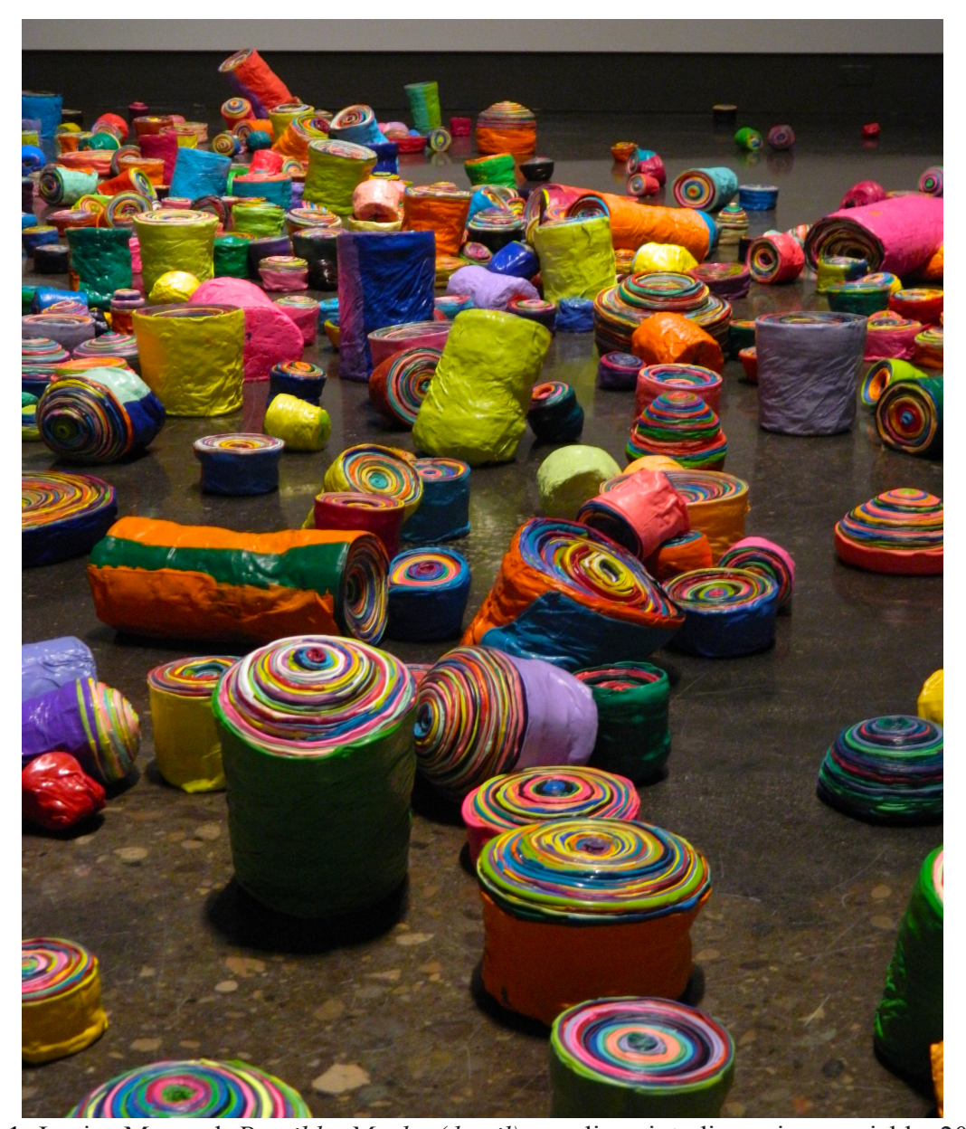
fig.1 Jessica Massard, Possibly, Maybe (detail) , acrylic paint, dimensions variable, 2013 With the help of my friends and studio assistants, I have created hundreds of these irregular objects. Although each one has its own unique character, they all function as a

results in an unevenness of shapes, sometimes creating irregular or angular objects, and sometimes concave or convex. This leads to different kinds of interesting imperfections and mutations, as each object is a trace of the person who rolled it.