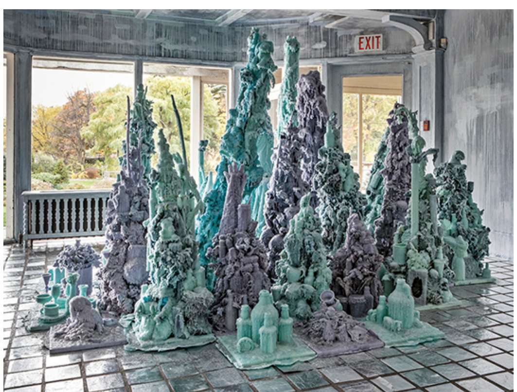
fig. 8 Tricia Middleton, Form is the Destroyer of Force, Without Severity There Can Be No Mercy, wax, paint, fabric, household materials, dimensions variable, 2012

Middleton's sculptures eerily allude to destruction and decay. The materiality of the wax and seductive colours make the work aesthetically pleasing, however the viewer can't ignore the fact that the impermanence of the wax will lead the work to slowly melt and degrade over time creating a post-apocalyptic scene (fig.8). The work of the Neo-Baroque artists such as Tricia Middleton and Lee Bul operate as a type of memento mori or warning for the inevitable consequences of a culture built on consumption and disposability. They engage with both historical Baroque and Neo-Baroque aesthetics and their works function as critiques of our society of the consumer spectacles.