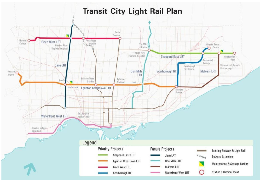
Figure 1.1 Transit City 4 Light Rail Plan

Adopted from Transit City Light Rail Plan, City of Toronto, 2010