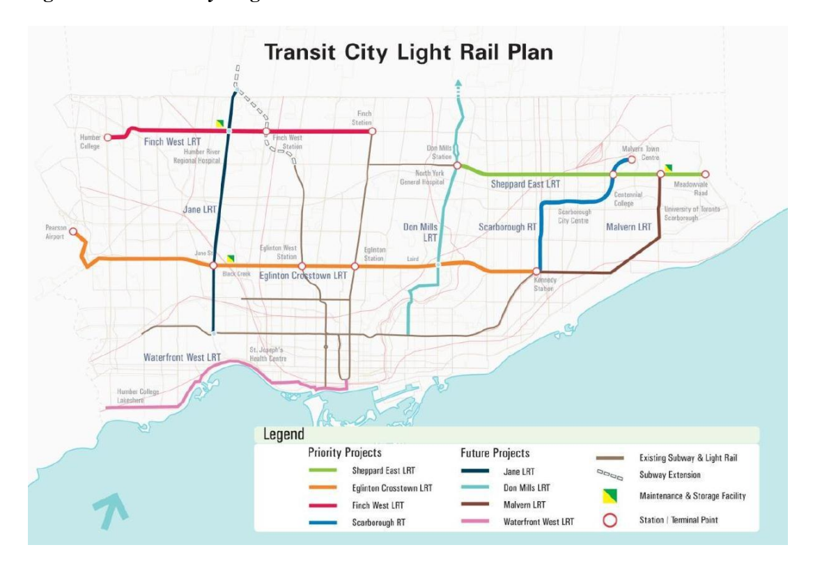
Figure 1.1 Transit City<sup>4</sup> Light Rail Plan

Adopted from Transit City Light Rail Plan, City of Toronto, 2010