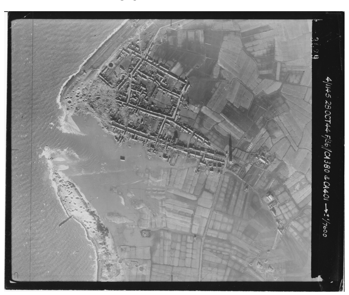
APPENDIX V Aerial Photographs, October-November 1944