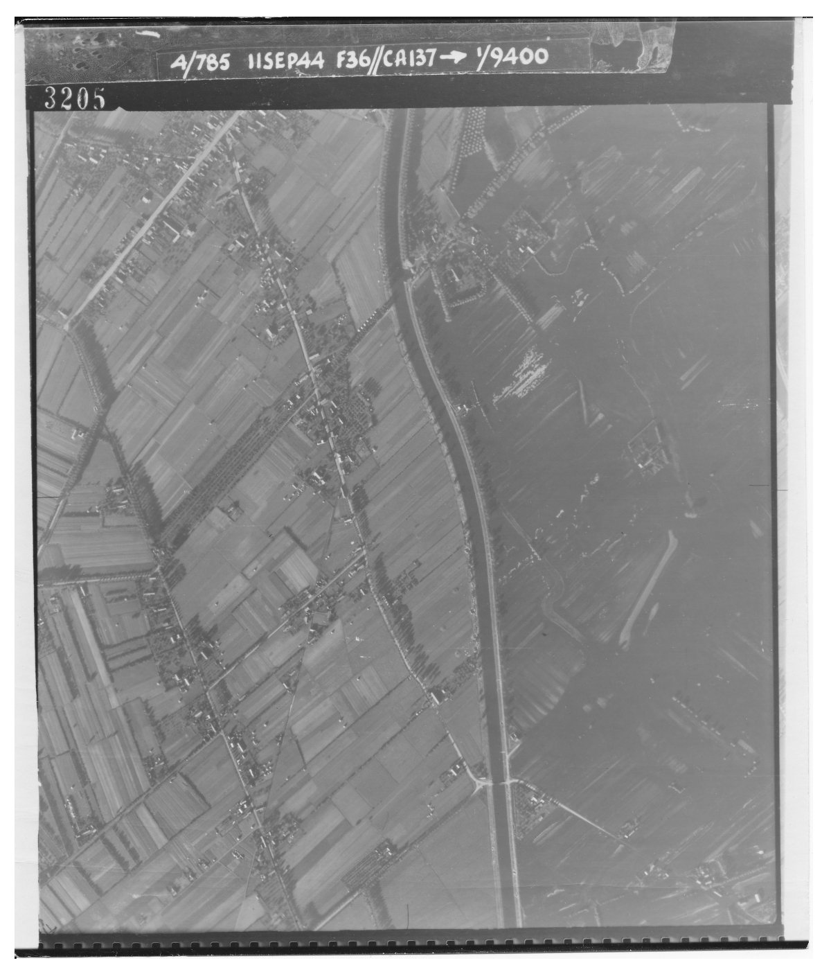
Figure 1.5 "Controlled" Flooding in Zeeuws-Vlaanderen, 11 September 1944