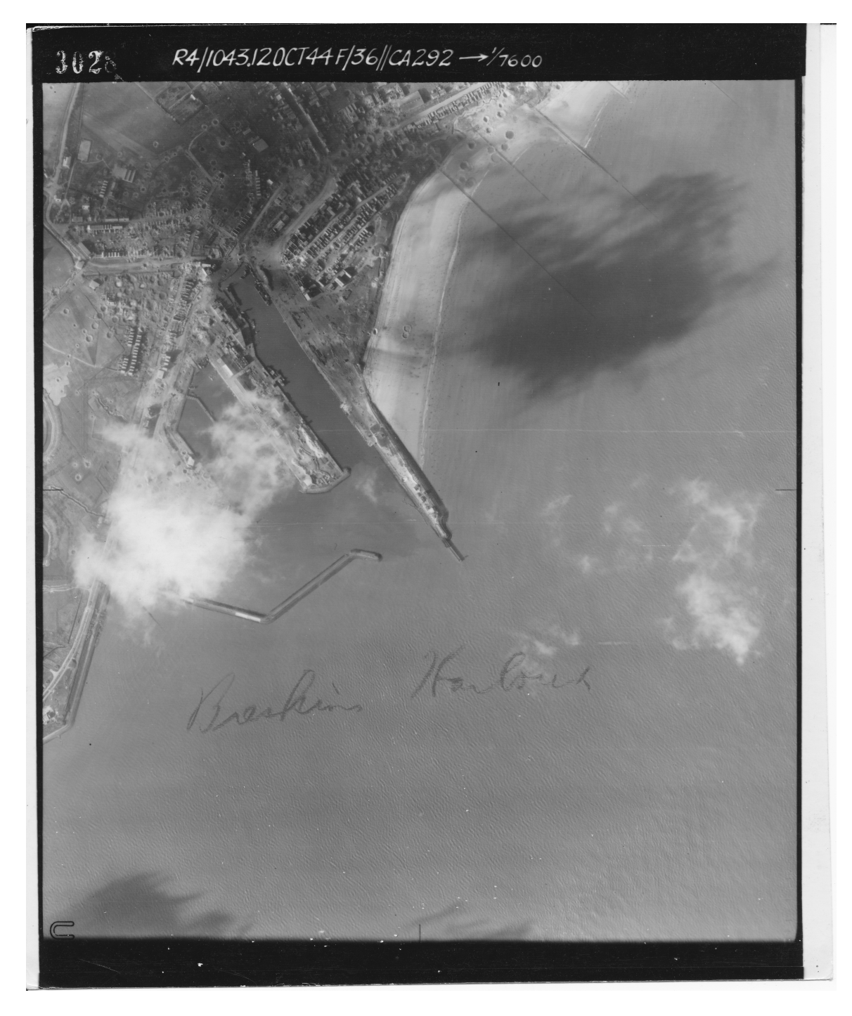
Figure 1.2 Breskens (Zeeuws-Vlaanderen), 12 October 1944